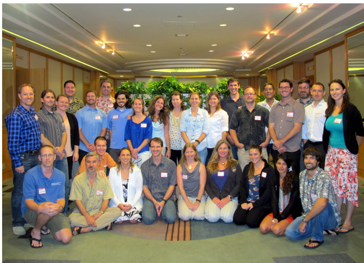
Attendees of the Coral Reef Resilience Research and Management Workshop. Photo taken November 4, 2014 in Honolulu, Hawai'i.