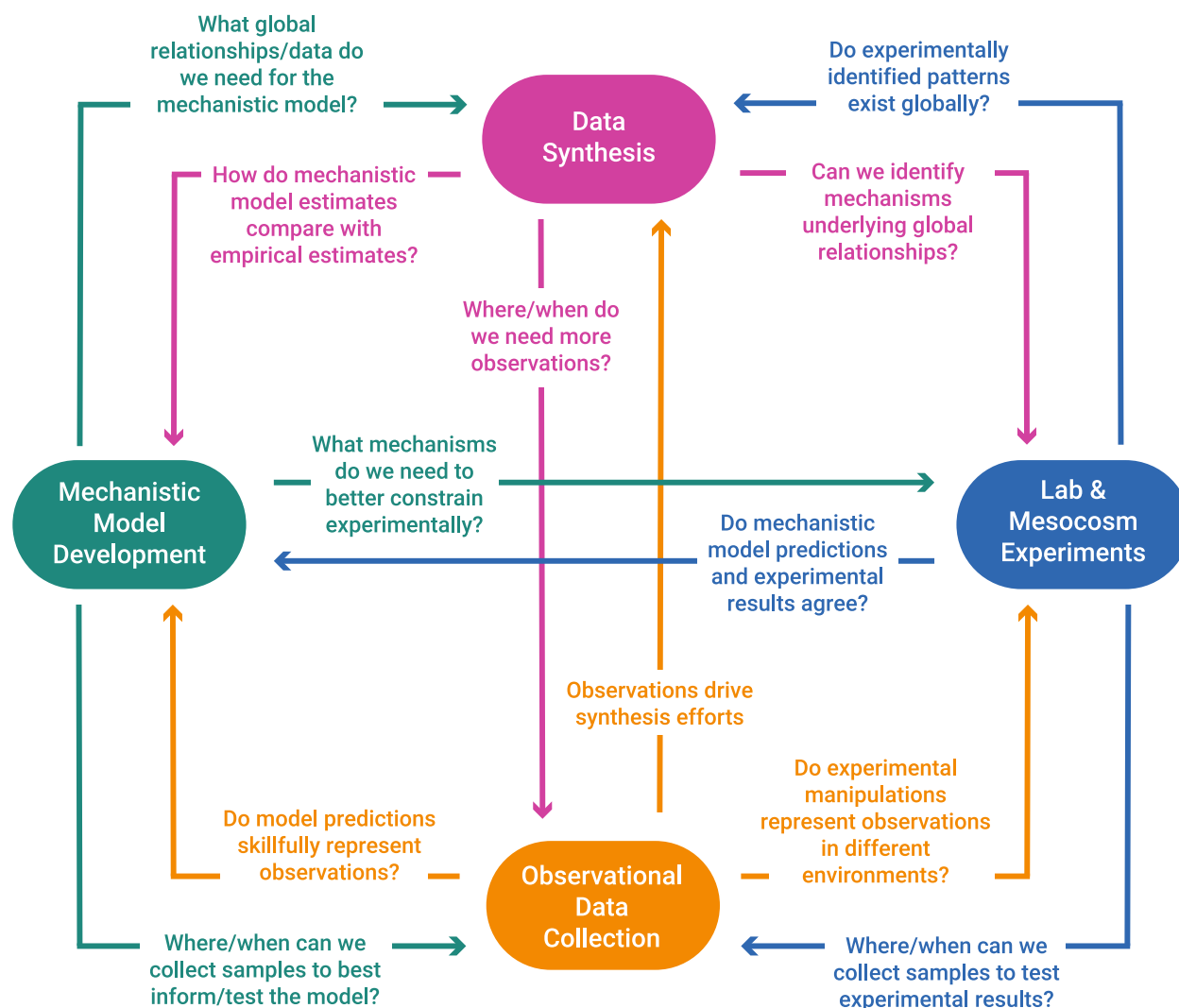
Figure 1. Diagram showing four interlinked key initiatives to improve the understanding of benthic ecosystem and diagenetic dynamics, and benthic-pelagic interactions. Arrows connecting different initiatives highlight the relationship between two individual initiatives.

Due to the significant variability in the complexity and structure of available models, there is currently little consensus on how benthic processes should be represented to achieve the goals of closing gaps in the global carbon budget and informing climate and ecosystem management solutions at large scales (Planchat et al., 2023), making assessments of particular scenarios challenging. Global ocean and Earth System models (ESMs) have historically relied on empirical relationships to close global budgets at the seafloor rather than mechanistic process representation (Hülse et al., 2017; but see Heinze et al., 1999), in part due to a lack of observational and theoretical constraints as well as computational limitations.