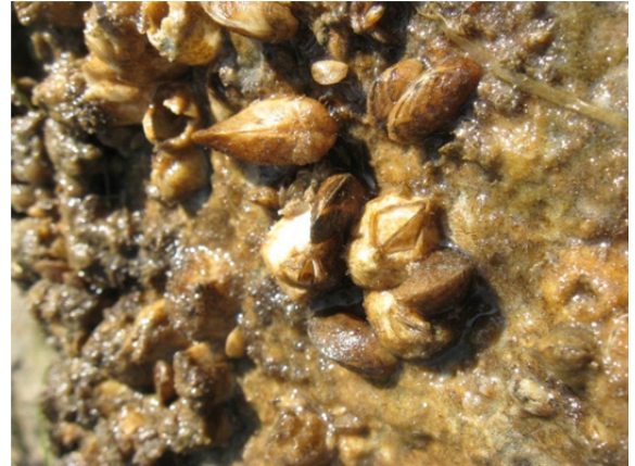
Figure 2. Mytilopsis leucophaeata in the Dniester liman (Photo: M. Son, 12 th August 2009).

Mytilopsis leucophaeata was found in 2001 in the Dniester Liman (Black Sea); however more intensive sampling in 2002 failed to find them again (Stepien et al. 2013; Grigorovich et al. 2002; I.A. Grigorovich, pers. comm.). Initial reports of M. leucophaeata in the Black Sea basin were documented by Grigorovich et al. (2002), who listed this species in an extensive literature review on alien species in the Ponto-Caspian region, and Theriault et al. (2004) identified M. leucophaeata among specimens collected from the region that were used to define dreissenid phylogeny (the year of collection was 2001; I.A. Grigorovich, pers. comm.). In August 2009, M. leucophaeata was recorded in the Dniester liman where populations were quite large (Table 1; Figures 2 and 3). Two live specimens in the Tuapse River bay of the Black Sea were collected in 2014. In the Dniester Liman, M. leucophaeata was found exclusively on hard substrates. In the Southern Bug River mouth area the species was sampled from concrete and granite