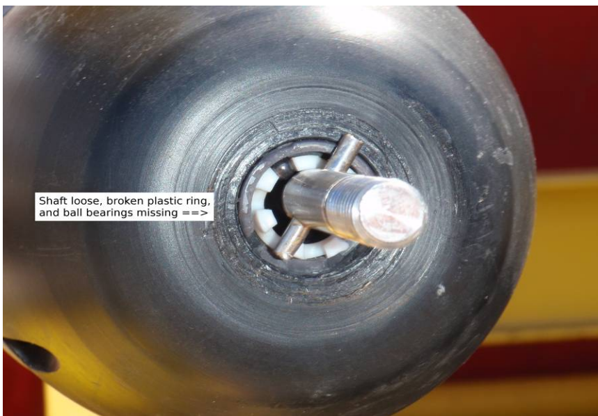
Figure 2.--AUV's Thruster Shaft.