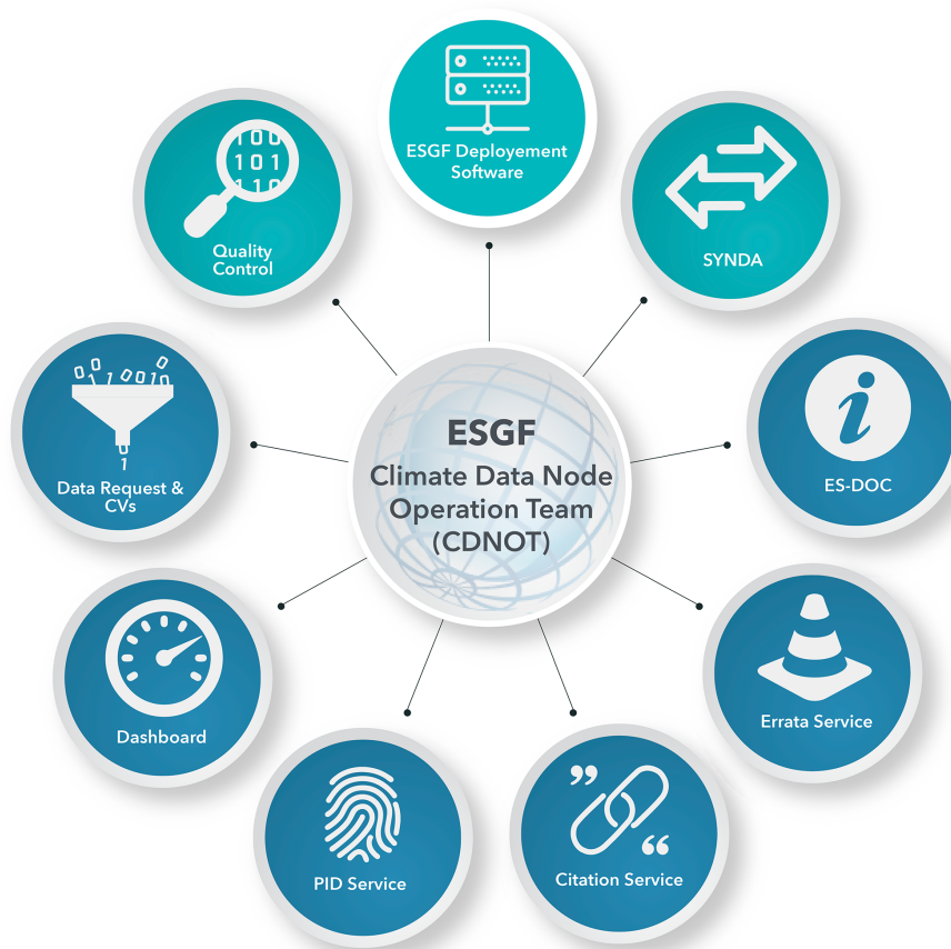
Figure 4. Schematic showing the software ecosystem used for CMIP6 data delivery. Note the darker blue bubbles are those that represent the value-added services.

May 2020), which was extended with hundreds of new terms to support CMIP6.