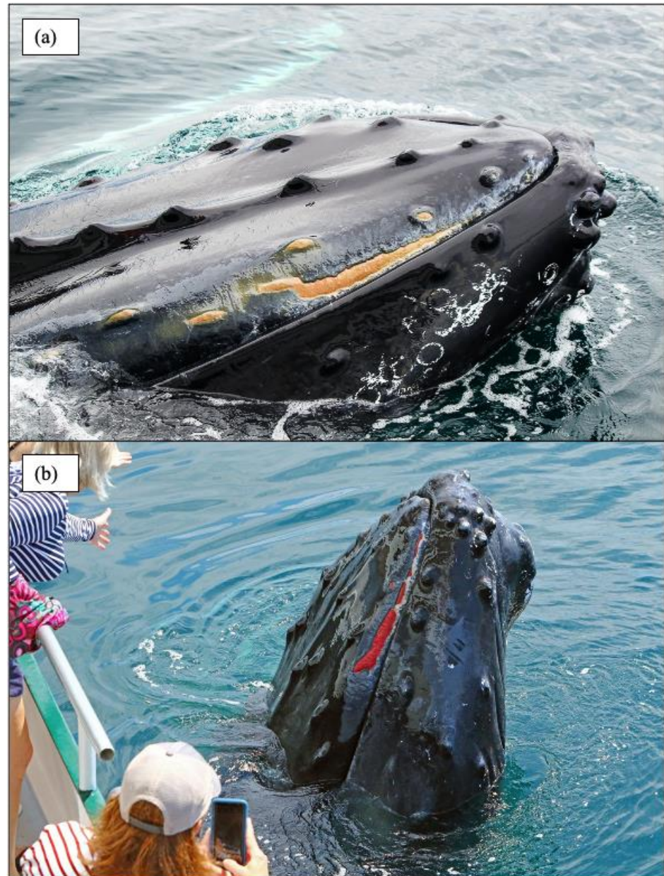
Figure 3. Photographs of observed skin lesions on the humpback whale, likely from bottom feeding for sand lance. (a) Wounds visible, including yellow, necrotic wound edges; (b) evidence from a different individual (not studied here) exhibiting recent abrasion to the same general region of the rostrum area.

At 1502 the whale detached itself from the jellyfish and then approached the observation vessel. At this time, clear evidence of skin lesions from bottom-feeding behaviors were observed on the whale's dorsal rostrum, suggesting a generalized deterioration of skin condition and yellow, necrotic wound edges (Figure 3). Recent abrasion to the skin of the affected area was also apparent, likely due to being covered by the stinging mass of the jellyfish. The whale made a quick visual investigation of the boat and remained near the boat for ~30 min before the vessel left. The individual whale was seen two days later at the same site, engaging in numerous well-described behaviors including lobtailing, tail and fin slapping, and breaching.