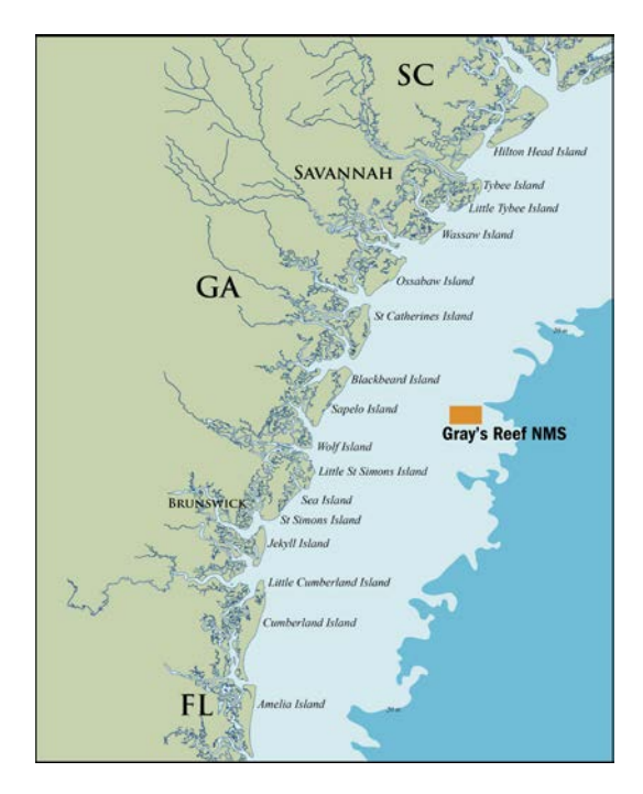
Figure 2: Location of Gray's Reef National Marine Sanctuary

The sanctuary is one of the most popular recreational fishing destinations along the Georgia coast. Fishing for pelagic species, such as King Mackerel, is one of the most prevalent activities, particularly during tournaments. For divers, access to the reef itself requires experience in open-ocean diving; currents can be strong and visibility varies greatly. For those who do not scuba dive or fish, the staff at GRNMS engages the public through extensive land-based education and outreach programs. For scientists, the sanctuary is a living laboratory for a variety of marine research and monitoring projects.