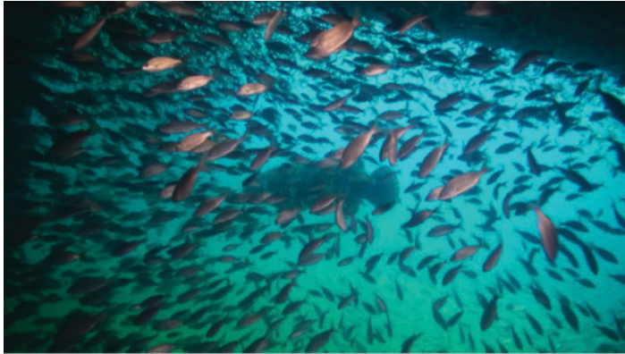
Figure 3. Increasing fish populations are often the ultimate goal when artificial reefs are deployed.

by many fish (Wall and Stallings 2018). Some fish species are even known to “recruit” to artificial reefs and use them as nursery habitat. At the same time, other studies show artificial reefs clearly attract larger fishes (e.g., jacks, tuna, sharks; Simon et al. 2011). Regardless of how many fish are “attracted” versus “produced,” artificial reefs are likely to affect fish vital rates, which are factors that affect population numbers, such as growth, reproduction, and survival. More on how artificial reefs impact fish and these vital rates can be found in part two of this artificial reef series.