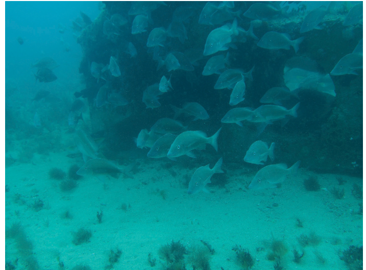
Figure 2. An example of an artificial reef with some smaller reef fish near it.

sensitive natural habitats. In other cases, artificial reefs can serve to protect coastlines and beaches by buffering wave action and reducing storm damage (Harris 2009). In Florida, some reefs are deployed specifically to help protect coral and natural hard bottom habitat, especially in popular recreational diving areas.