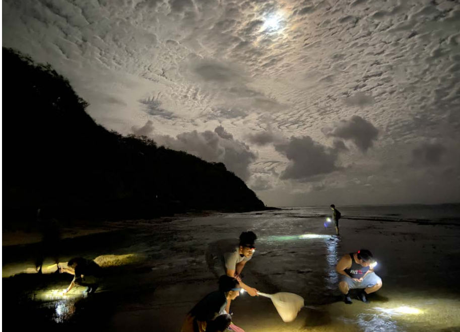
FIGURE 2. In addition to providing mentorship and financial support, Maile also builds community by organizing culturally grounded activities. In Hawaiian culture, the lunar calendar is referenced for fishing, farming, productivity, and deep-sea voyages. Here, Maile mentors and mentees observe the intertidal zone during the full moon in March 2021.

conflicts (societal, community, and individual), participants were encouraged by the possibility of pursuing graduate degrees and stable jobs in STEM and contributing to bettering both the community and the environment.