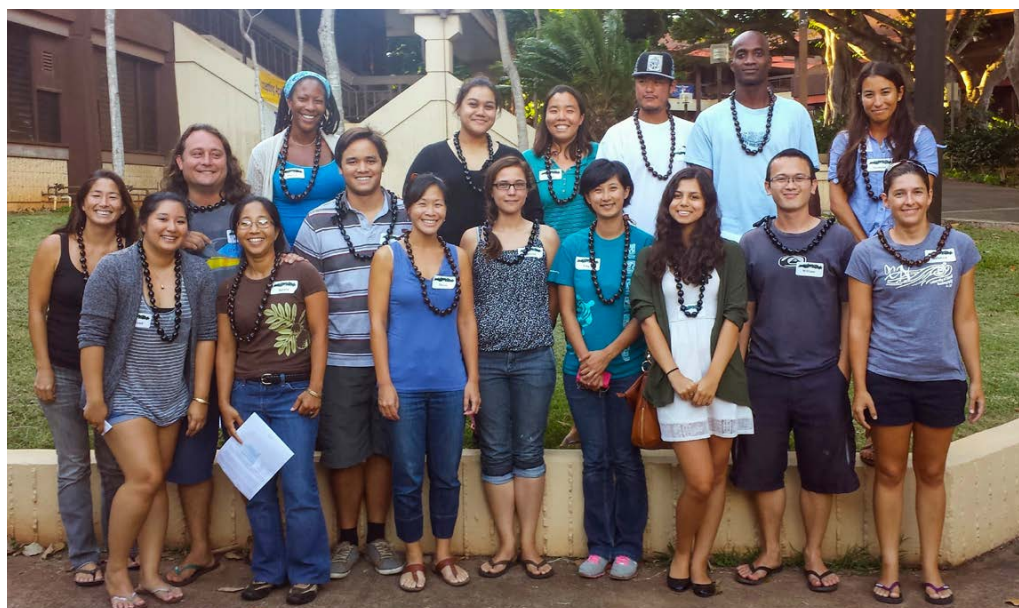
FIGURE 1. The inaugural 2013 Maile Mentoring Bridge cohort included undergraduate mentees from Kapi’olani Community College and University of Hawai’i at Mānoa (UHM) and mentors from UHM who were graduate students, postdocs, or recent graduates. Since 2013, numerous mentees have transitioned to mentors and program managers, and several mentors are now faculty.

For many, the idea of success transformed through their participation in Maile. Many shared that they were not able to envision degrees or careers beyond a bachelor’s degree in SOEST. However, through direct exposure to different types of place-based research, meaningful interactions with scientific role models (e.g., women, Native Hawaiians), and a safe space to air and discuss a range of