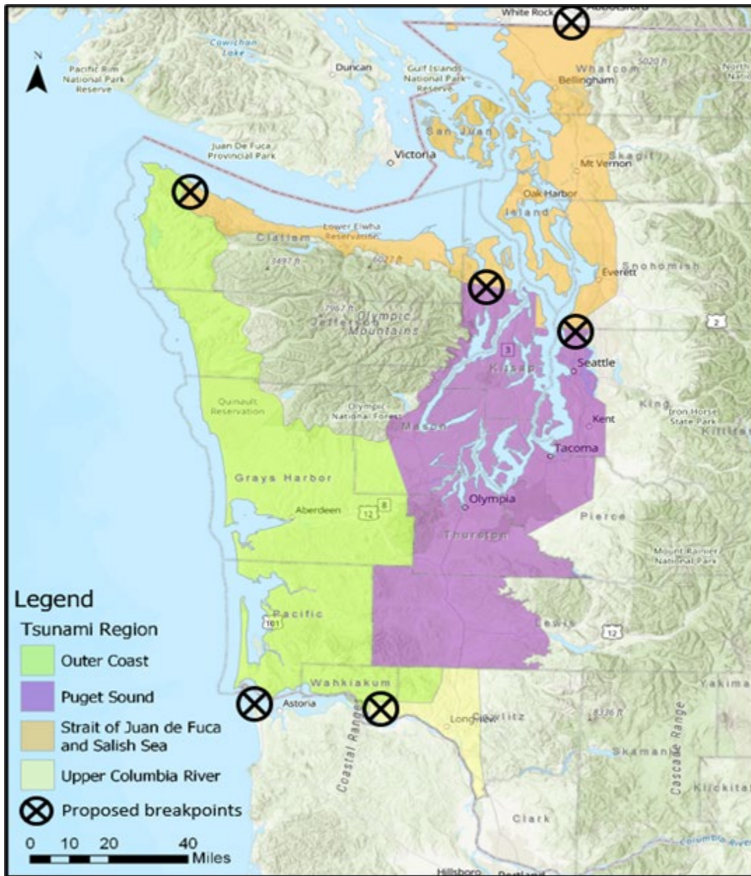
Figure 2 Breakpoints (black circles with X) requested by Washington state as a minimum number necessary to enhance tsunami alerting in Washington State.