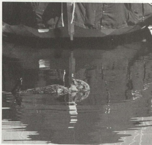
California Sea Otter.

Monthly, seasonal, and inter-annual variation in surface kelp canopies and demographic characteristics of red abalone and other biotic components of sea otter habitats are analyzed and compared with areas not currently supporting sea otters in order to determine the preferred prey species and activity patterns of sea otters, and to clarify the substantial interactions that take place between sea otters and invertebrates and plants in their communities.