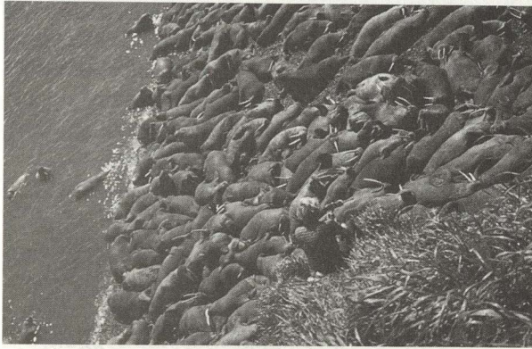
Pacific walrus.

sea otter pelts in Hawaii. Prosecution is pending in each case. One of the suspects had been apprehended and prosecuted for a similar violation in 1982. In a second case, the suspect was also found to be in illegal possession of eagle, owl, and hawk feathers, and narcotics.