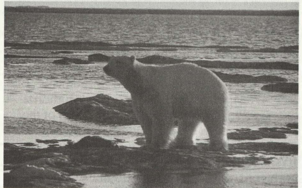
Polar bear.

The Service administers requests for waiving the moratorium and for the transfer of management authority to States, issues permits, conducts research programs, enforces provisions of the Act, publishes rules and regulations to manage marine mammals, cooperates with the States, and participates in international activities and agreements. In addition, the Service lists and delists species as endangered or threatened and undertakes other Endangered Species Act (ESA)-related responsibilities and