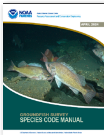
See the companion manual for species codes.