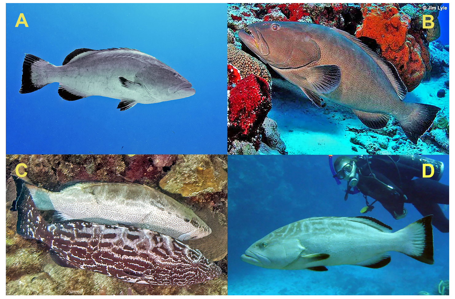
Figure 2. Underwater photographs showing the diversity of color patterns in Mycteroperca bonaci , A: Cozumel, 20 m, (Richard Eaker); B: Cozumel, 20 m (Jim Lyle); C: Roatan, 10 m, (Luiz Rocha), note that both individuals are M. bonaci ; D: Belize, 10 m (Brad Erisman). Note that the photo in B is the color morph described as " Mycteroperca profundorum " by Cervigón (2011).

color patterns (Fig. 2). In his revision of American groupers, Smith (1971, p. 179) commented on Poey's original description of M. bonaci saying "Felipe Poey seems to have described Mycteroperca bonaci no less than 6 times and in doing so has recorded the momentary color changes to which this species is subject" (in fact, he described the species 8 times according to Ronald Fricke, pers. comm.). Cervigón (1989, p. 344) noted color change by individuals of M. bonaci living in aquaria, with the reticulated color pattern replaced by a uniform pale grey-brown color with faint orange spots on the head: it is odd that he seems to have not considered this for wild specimens.