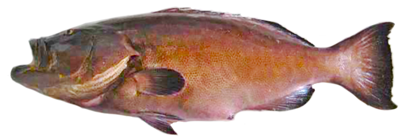
Figure 1. Mycteroperca profundorum Cervigón, 2011 holotype (upper) and paratype (lower). Images reproduced from Cervigón (2011).