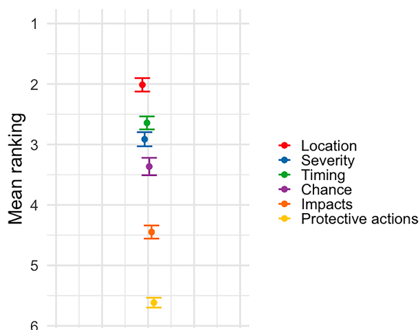
FIG. 2. Mean rankings of importance for different information attributes. A ranking of 1 indicates the most important piece of information, whereas a ranking of 6 indicates the least important piece of information. Error bars represent the 95% confidence interval. Note that these are overall rankings and are not specific to any time frame.

This section will present the results of a set of survey questions from Wave 2 to serve as an example of the information that this project can provide. The motivation for this experiment was to better understand the types of information (also called information attributes ) that are important to EMs as they face an upcoming hazardous weather event and whether those attributes change over time. This experiment and a similar analysis were also conducted for members of the public via the Institute for Public Policy Research and Analysis's