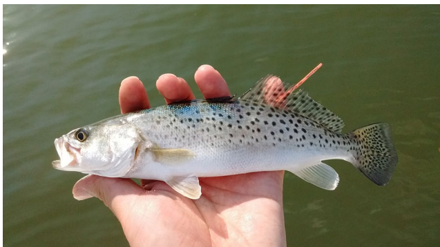
FIGURE 1 Spotted seatrout, Cynoscion nebulosus , on York River, Virginia.

The quality of the de novo-assembled spotted seatrout liver transcriptome was assessed using QUAST and BUSCO. QUAST indicated that this transcriptome contained 21,316 transcripts longer