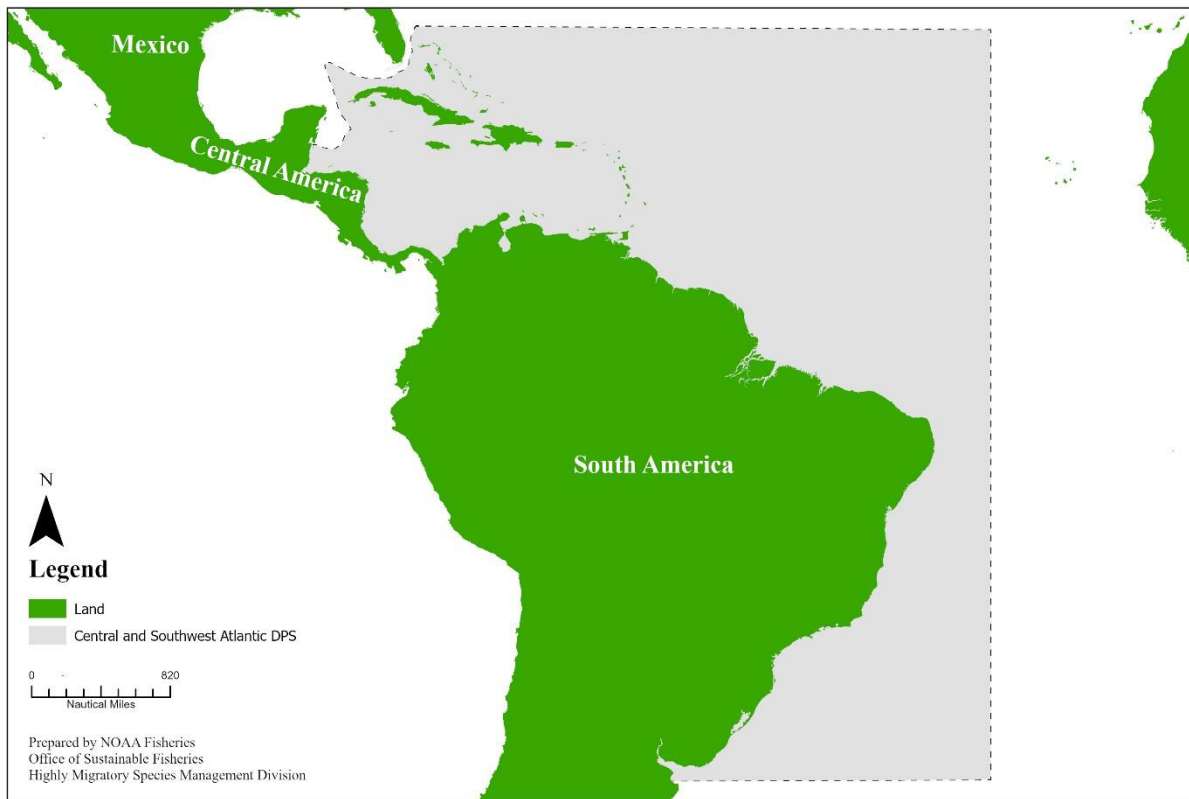
Figure 1.1 Boundaries of the Central and Southwest Atlantic DPS of Scalloped Hammerhead Sharks

by 30° W. long., and to the south by 36° S. lat. (Figure 1.1). All waters of the Caribbean Sea are within this DPS boundary, including the Bahamas' Exclusive Economic Zone (EEZ) off the coast of Florida, the U.S. EEZ off Puerto Rico and the U.S. Virgin Islands, and Cuba's EEZ.