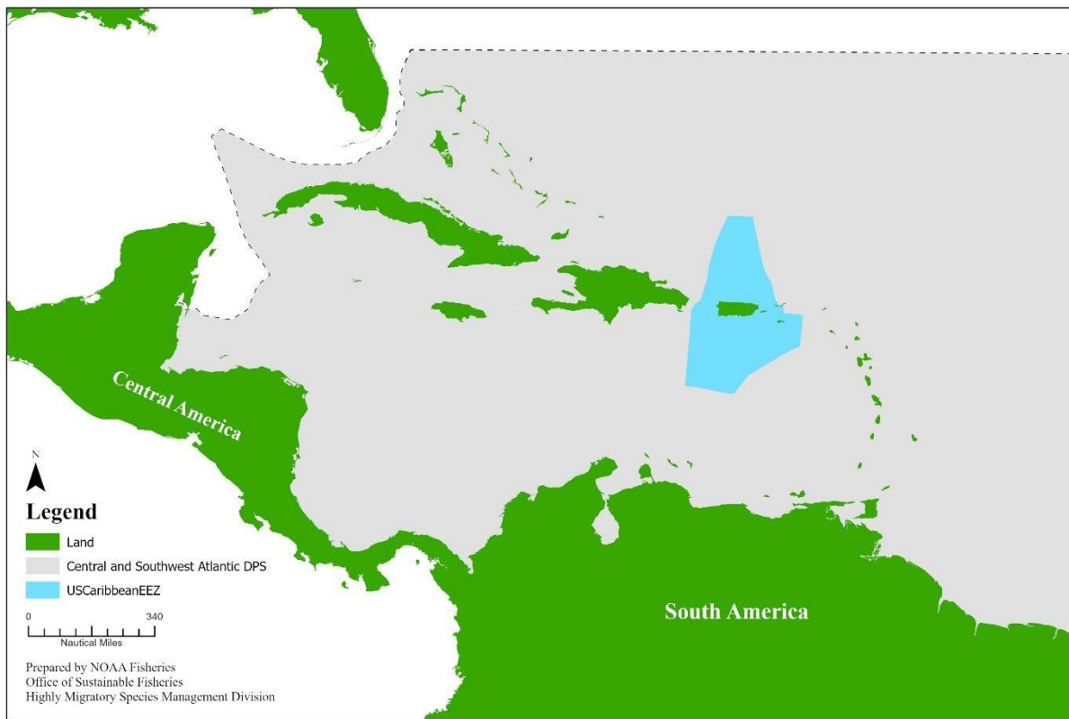
Figure 2.2 Location of the U.S. Caribbean Region

Under Alternative B2, NOAA Fisheries would prohibit the possession and retention of scalloped hammerhead sharks in all HMS commercial and recreational fisheries within the U.S. Caribbean region. Under this alternative, scalloped hammerhead sharks could not be retained, possessed, landed, sold, or purchased within the U.S. Caribbean region, which is defined as the Caribbean Sea and Atlantic Ocean seaward of Puerto Rico, the U.S. Virgin Islands, and possessions of the United States in the Caribbean Sea (see 50 CFR § 622.2) and is shown in Figure 1.2.