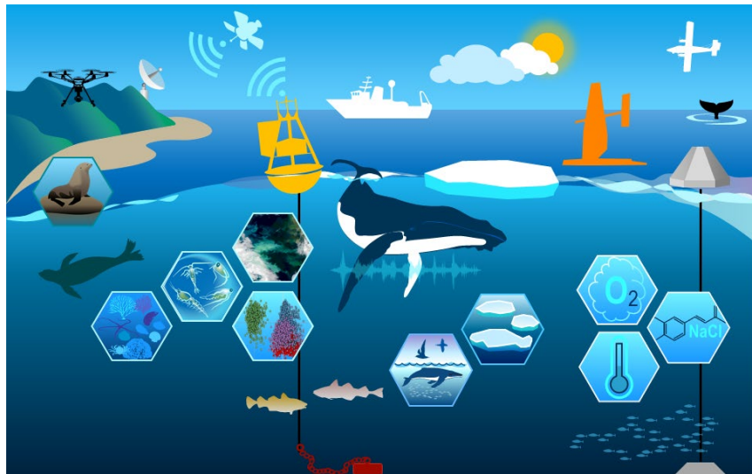
Figure 1. -- Advanced technology, such as uncrewed surface vehicles and eDNA samplers on moorings, are being used or are under development by the AFSC and partners.

While considerable progress has been made on these issues, primarily using temporary funds from NMFS or from OAR, full transition to operations requires substantial and sustained support. Staff with new types of expertise, such as data scientists and programmers are needed to provide a technical interface between data collection and the new advanced tools used by the agency. In addition, continual investments in equipment, such as new uncrewed systems and passive acoustics recorders, are needed because existing equipment is dated and needs to be replaced on a rotating cycle or risk failure during deployment and subsequent loss of data. Advanced technology also offers excellent opportunities to address key information gaps for marine mammals and help to modernize marine mammal assessments in Alaska.