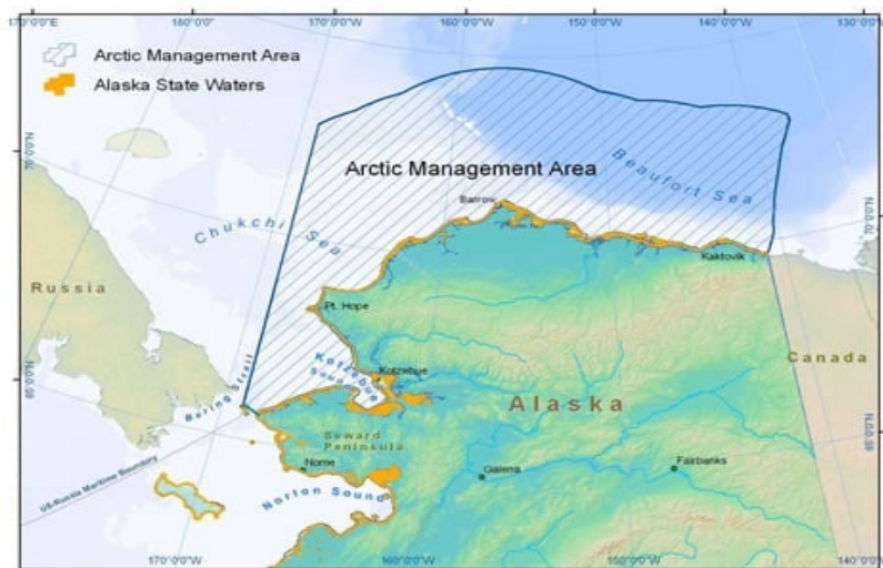
Fig. 1 -- Area defined for the Arctic RAP (using figure developed for the Arctic FMP, from https://www.npfmc.org/arctic-fishery-management/ ), where the U.S. EEZ does not include Alaska state waters (orange shading) and is restricted to offshore waters (hatched blue lines).

The North Pacific Fishery Management Council (NPFMC) had defined a Fishery Management Plan for the Fish Resources of the Arctic Management Area (“Arctic Fishery Management Plan” in the following) for the U.S. Exclusive Economic Zone (“EEZ”) of the Beaufort and Chukchi seas; and we here use these same geographic boundaries to define the Arctic Regional Action Plan (“Arctic RAP”). The NPFMC developed the Arctic Fishery Management Plan in 2009. This plan prohibits commercial fishing (excluding salmon and halibut) “until sufficient information is available to support the sustainable management of a commercial fishery” (NPFMC 2009). In 2018, the United States led negotiations for the Agreement to Prevent Unregulated High Seas Fisheries in the Central Arctic, which is the first multilateral agreement of its kind to take a legally binding, precautionary approach to protect the Arctic from commercial fishing before such fishing has begun. The Agreement has two principal objectives: the prevention of unregulated fishing in the high seas portion of the central Arctic Ocean and the facilitation of joint scientific research and monitoring.