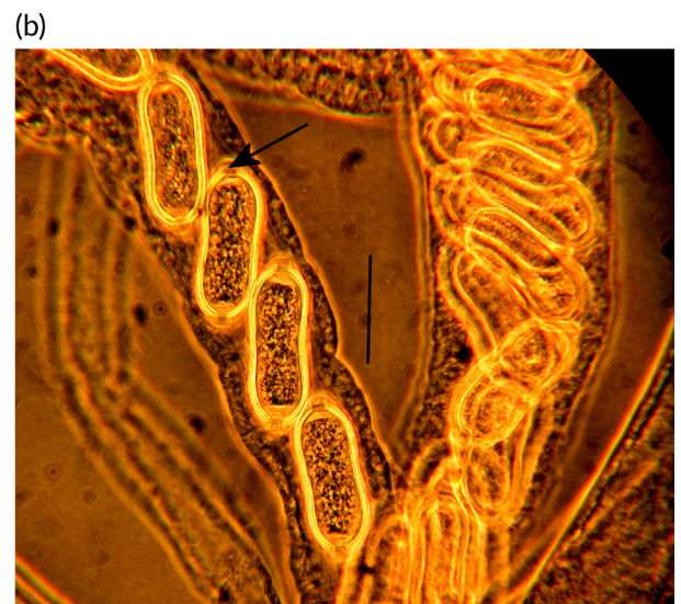
FIGURE 4 Piscicapillaria sp.: (a) whole nematode; (b) eggs, with the protruding polar plugs. Arrowed. Scale bars: a = 1 mm, b = 50 \mu m