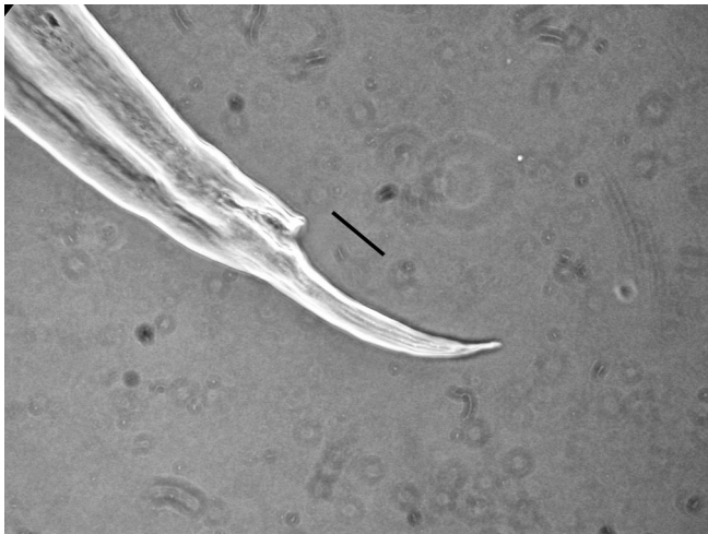
FIGURE 2 Hysterothylacium sp. Tail of male. Scale bar = 50 \mu m

The composition of cestode species in the blue shark in this study area is similar to that in previous studies. Anthobothrium caseyi , P. auriculatum and Paraorygmatobothrium sp. were found further south off the west coast of Baja California Sur, Mexico, where they each had a prevalence higher than 50% in a sample of 27 blue sharks