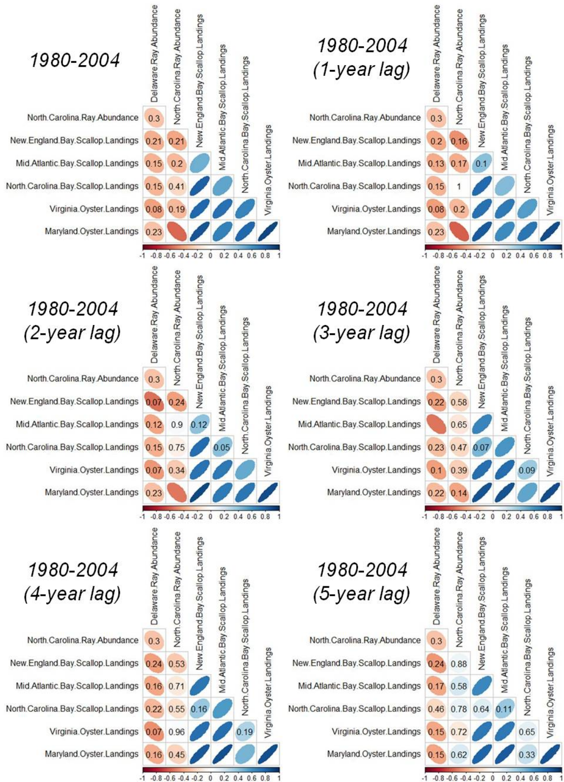
Supplemental Figure 2. Correlation matrices of model estimates for Delaware Bay and North Carolina cownose ray relative abundance and shellfish landings data including a 1,2,3,4, and 5-year lag of landings data for bay scallops (New England, Mid-Atlantic, and North Carolina) and oysters (Virginia and Maryland) between 1980 and 2004. Numerical values denote p-values for non-significant correlations ( \alpha=0.05 ).