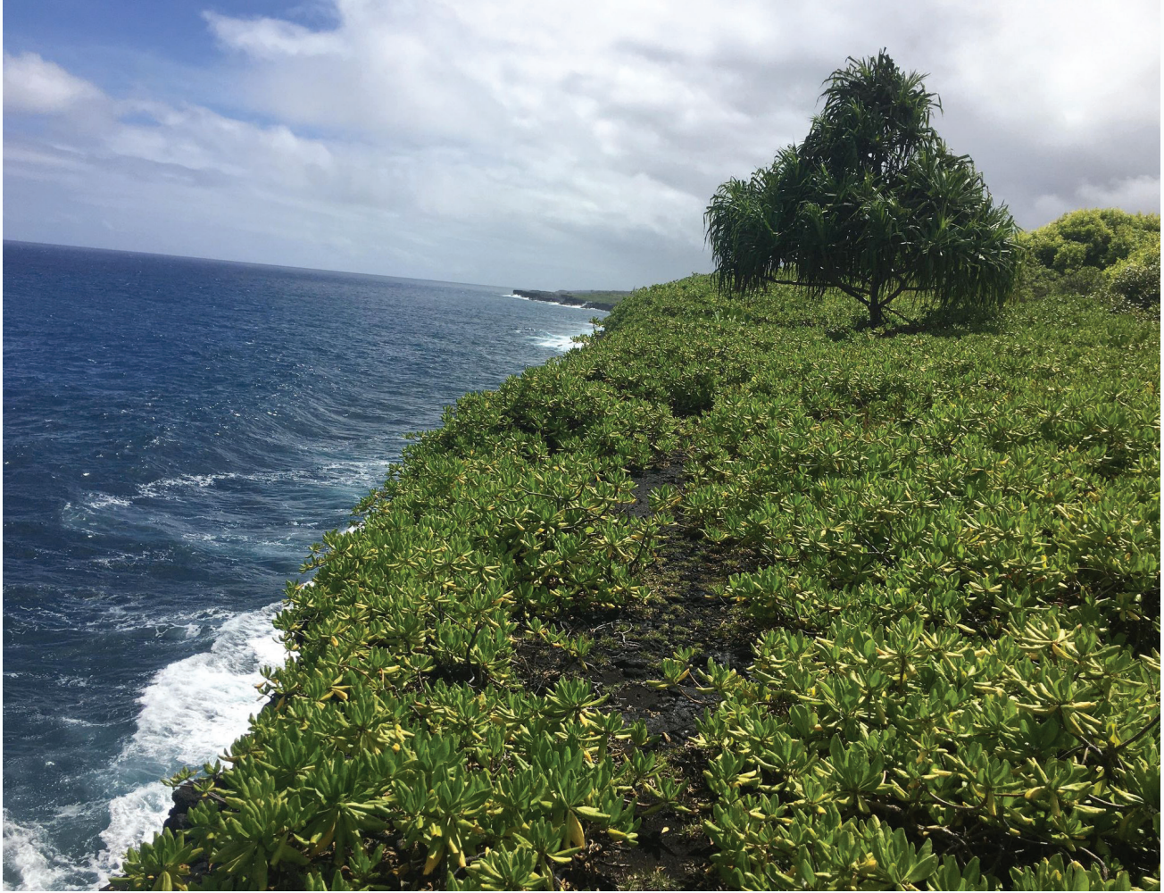
▲ FIGURE 4. Single mature hala on immediate Kalapana coastal edge, June 2020.