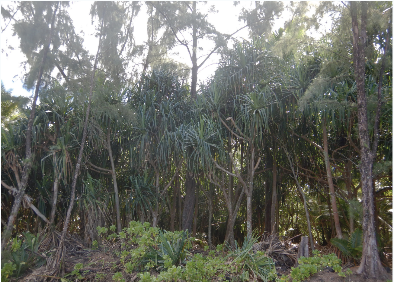
▼ FIGURE 5. Hala grove beneath ironwood canopy, January 2022. GINA MCGUIRE

This work documents the story of hala decline with high detail in a specific locality and the recognized