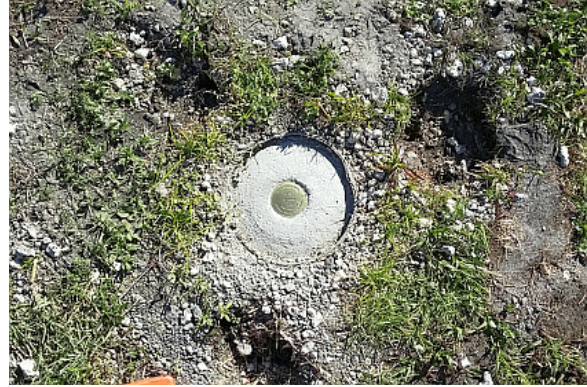
Figure 3 - FLF1 RM 3 (FLR3)

FLR2 is a NGS reference mark disk stamped ---FLF1 NO 2 2014---, set flush with the ground in the top of a 30-cm (in diameter) poured-in-place concrete post extending to a depth of 130 cm.