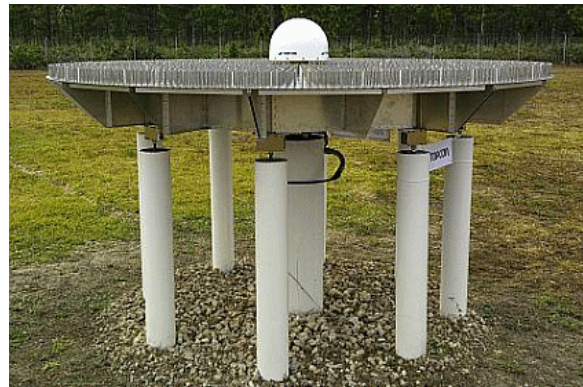
Figure 8 - FL FOUND 2 BIGANT (FLF2)

FLF1 is a dimple within the GNSS antenna adapter of a short drilled braced monument and is centered 0.0083 m beneath the ARP. For more information, enter CORS SiteID FLF1 at NGS's CORS webpage .