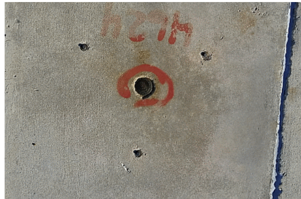
Figure 4 - 7295 (RCM2)

RCM2 is a NGS horizontal control mark disk stamped ---7295 1988--- and cemented into a drill hole in the center of a concrete pad.