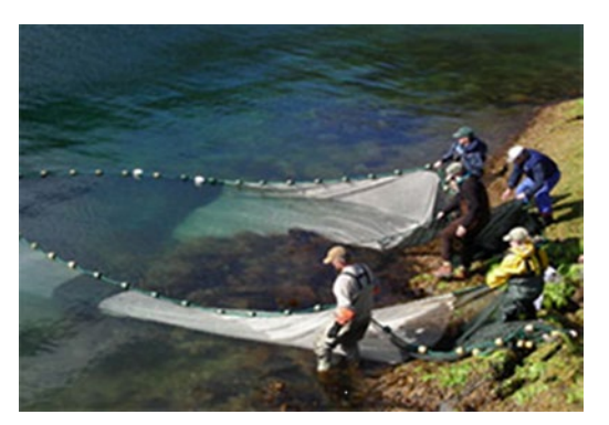
Figure 6. Scientists from Ted Stevens Marine Research Institute conducting nearshore Surveys.