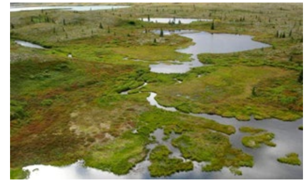
Figure 2. Wetland, pond, stream complex; headwaters upstream of the confluence of the North and South fork Koktuli River.

Headwater streams provide habitat complexity, increased prey availability, and refuge from predation (Meyer et al. 2007, Whigham et al. 2012). In Alaska, headwater streams are abundant and can be an important spawning and rearing habitat for juvenile salmonids (Woody and O'Neal 2010, Copeland et al. 2014). Food webs in headwater reaches are reliant on terrestrial subsidies from invertebrates, riparian areas, and instream nutrients (Piccolo and Wipfli 2002, Wipfli and Gregovich 2002, Walker et al. 2012).