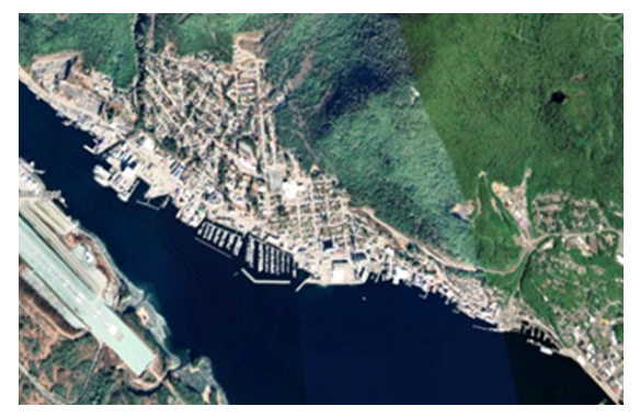
Figure 8. Satellite image of shoreline coastal development, generated using Google Earth Pro.

An increase in the number and size of operating vessels can cause more erosive wave and surge effects on shorelines. Vessel wakes can cause a significant increase in shoreline erosion, deteriorating wetland habitat, and increase water turbidity. Vessel prop wash can also damage aquatic vegetation and disturb sediments, which may increase turbidity and suspend contaminants (Klein 1997, Warrington 1999). When anchored in shallow nearshore waters, mooring buoys can drag the anchor chain across the bottom (anchor sweep), destroying submerged vegetation and creating a circular scour hole (Walker et al. 1989).