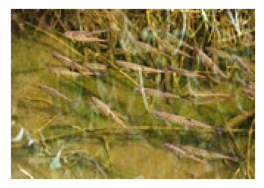
Figure 3. Salmon parr found during surveys of headwater tributaries in the upstream of the confluence of the North and South fork of the Koktuli River.

Absent data, it is best to take a precautionary approach when determining if headwater tributaries in Alaska support anadromous salmon or not. For example, many upper reaches within watersheds south of the Brooks Range still require surveys and mapping to determine