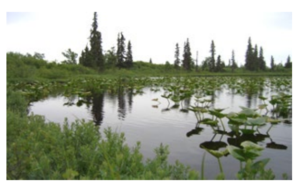
Figure 1. Denslow Lake, Chuitna watershed.

Snowmelt and rainfall saturate the Alaskan landscape, forming extensive freshwater wetland areas ranging from lowlands and depressions to hillsides and slopes (Hall et al. 1994). Alaska's wetlands occupy approximately 43 percent or 690,000 km<sup>2</sup> (266,410 mi<sup>2</sup>) of the state's 1.7 million km<sup>2</sup> (663,267 mi<sup>2</sup>) surface area (Dahl 1990). The majority of Alaska's wetlands are in the interior, Arctic, and western regions of the state. Only 42 percent of Alaska's wetlands are mapped (USFWS 2013).