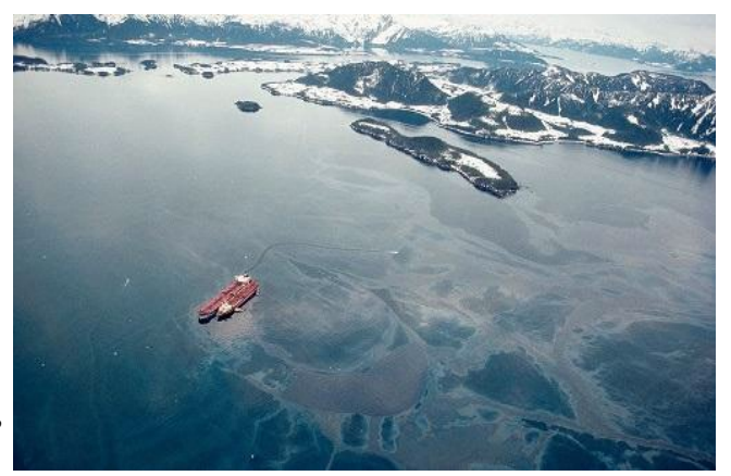
Figure 9. Aerial photograph of the oil tanker Exxon Valdez, circa March 1989.

One such gas leak occurred in Cook Inlet in 2021, when aging infrastructure from an oil platforms natural gas pipeline ruptured leaking between 5,947 to 9,203 m<sup>3</sup>(210,000 to 325,000 ft<sup>3</sup>) of natural gas (98.67 percent methane and other hydrocarbons) per day. The leak was discovered on February 7, 2017, and before coming under control was believed to have released 235,030 m<sup>3</sup> (8.3 million ft<sup>3</sup>) of natural gas<sup>41</sup>. Since then there were several other leaks of lesser volumes, all more readily put under control.