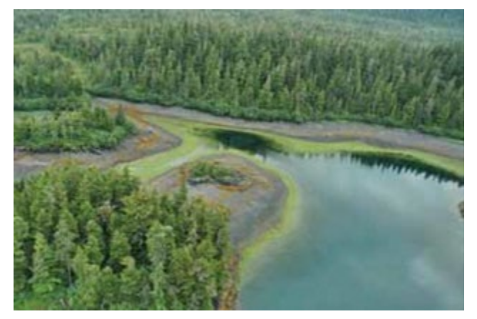
Figure 5. Eelgrass ( Zostera marina ) in Prince William Sound. Published in Coastal Impressions, A Photographic Journey along Alaska's Gulf Coast ; A.P.J., 2012.

The GOA stretches west from the Alaska Peninsula near Kodiak Island to the southern tip of Prince of Wales Island. Its northern boundary is the coast of Alaska and the southern extent is a line from the southern end of Kodiak Island to the Dixon Entrance. It includes Cook Inlet, Prince William Sound, the Copper River Delta and the 400-mile long Alexander Archipelago. In southeast Alaska, the Alexander Archipelago has over 2,900 estuaries encompassing a total surface area of 30,721 km<sup>2</sup> (11,861 mi<sup>2</sup>) (Albert and Schoen 2007). At 1,181 hectare (2,900 acres), the Stikine River Delta is the largest of these estuaries. The GOA includes two large estuary systems: Cook Inlet, which is