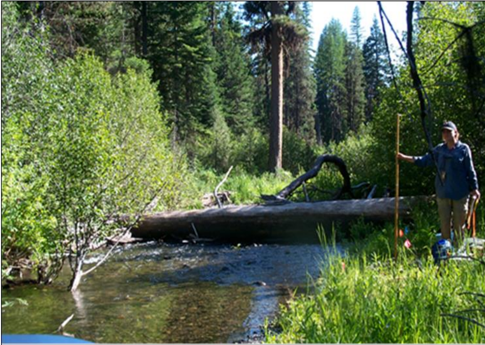
Figure 3 E.F. Canyon Creek at the PIBO Integrator site. Photo taken on 7/14/2004.