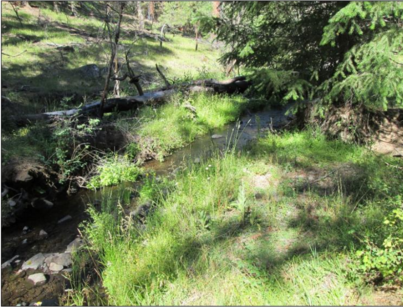
Figure 1 Wall Creek near the DMA in the Lake Pasture. Photo taken on 6/10/2016.

Photographs at or near MIM DMA monitoring sites and PBO sites are displayed in Figures 1 through Figure 4.