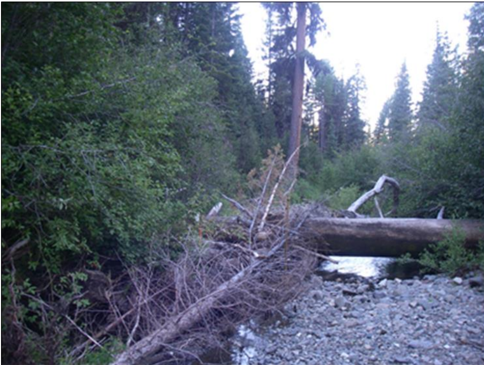
Figure 4 E.F. Canyon Creek at the PIBO Integrator site, same location as Figure 3 above. Photo taken on 7/22/2010.