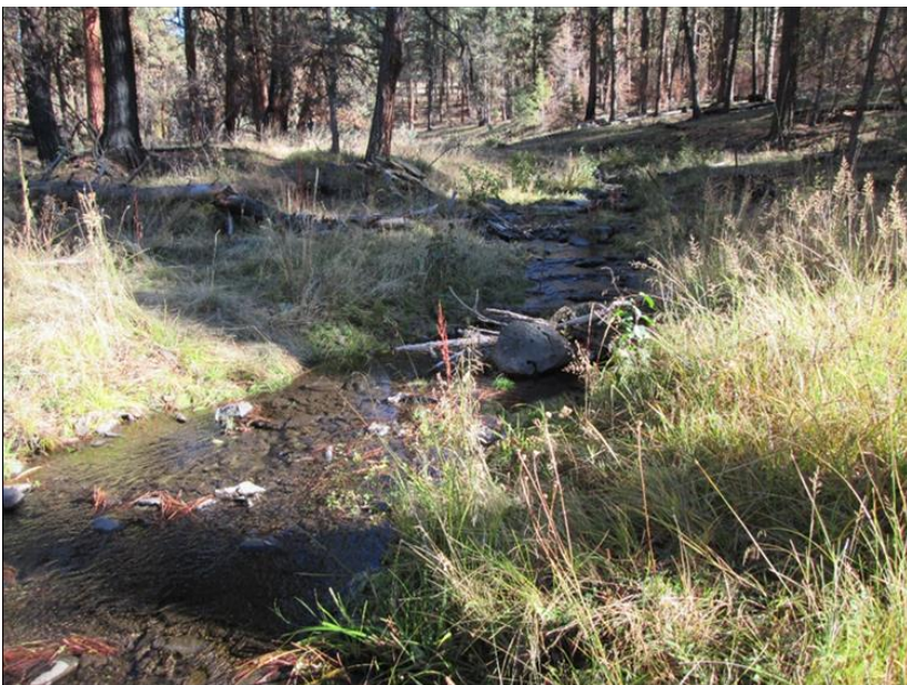
Figure 2 Wall Creek near the DMA in the Lake Pasture. Photo taken on 10/11/2016. Note the burn scars in the background.