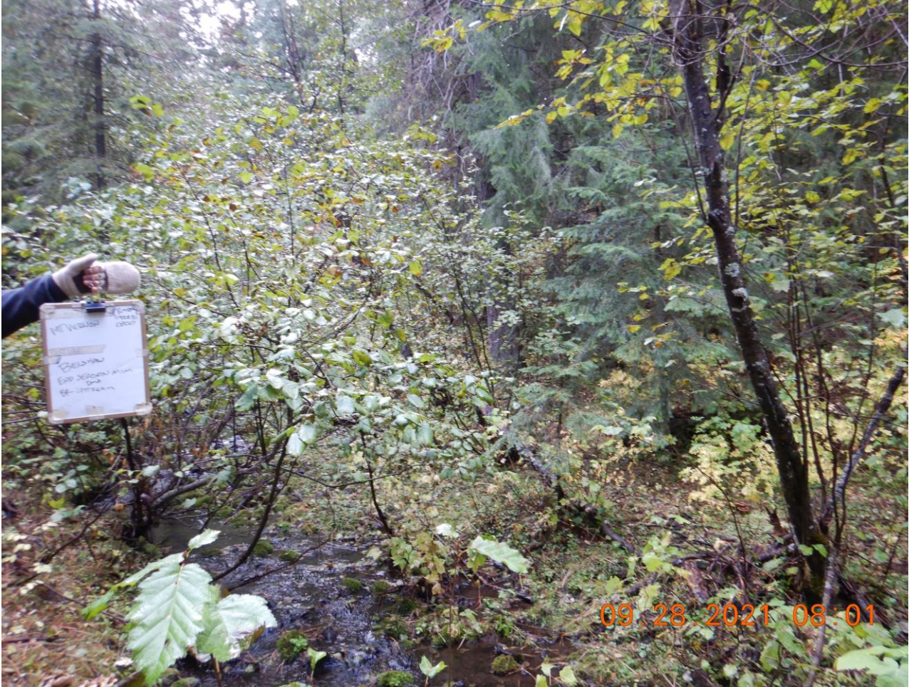
Figure 2. Belshaw Creek in Belshaw Pasture looking upstream at the DMA, post season use. 9/28/2021