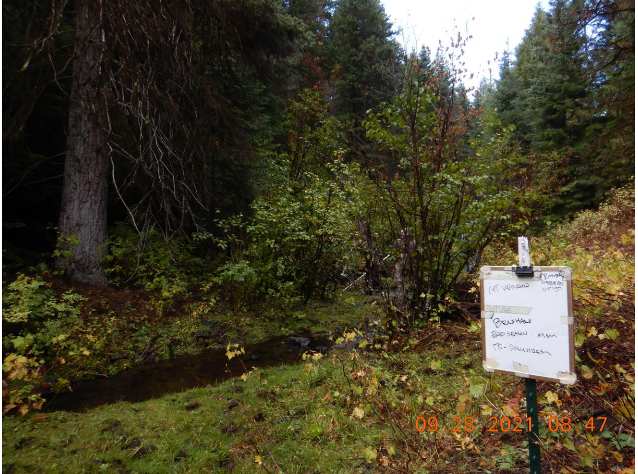
Figure 3. Belshaw Creek facing at downstream end of DMA. Post season use, 9/28/2021