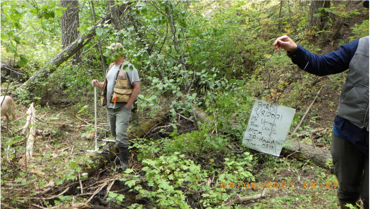
Figure 1. Bear Creek DMA, post season use. Photo facing downstream on 9/8/2021.

Photographs in PIBO monitoring reaches, at or near MIM DMA monitoring sites, and/or within MSRA are displayed in Figure 1 to Figure 8.