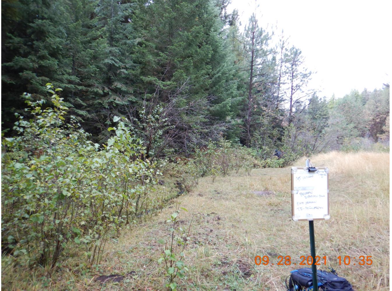
Figure 4. Belshaw Creek in Belshaw Riparian Pasture at downstream end of DMA, post season use. 9/28/21