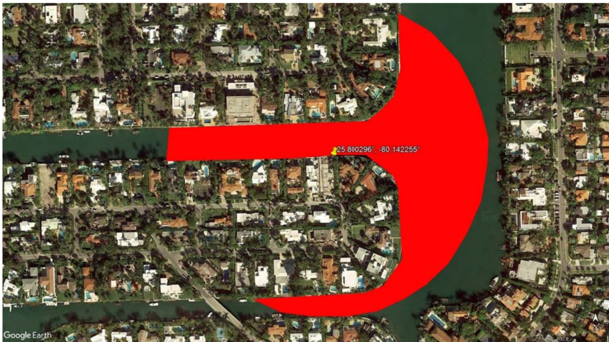
Figure 1. Image showing the action area defined by the extent of behavioral noise effects based on the proposed action’s installation of piles using impact hammer.

The action area is defined by regulation as “all areas to be affected directly or indirectly by the federal action and not merely the immediate area involved in the action” (50 Code of Federal Regulations [CFR] 402.02). As such, the action area includes the areas in which construction will take place, as well as the immediately surrounding areas that may be affected by direct effects and indirect effects of the proposed action. Based on our noise analysis in SAJ-82 (NMFS 2014), the action area is equivalent to the radius of behavioral noise effects to ESA-listed fishes based on the proposed action’s installation of 12-in wood piles using impact hammer (i.e., 705-ft behavioral noise radius shown in red; Figure 3).