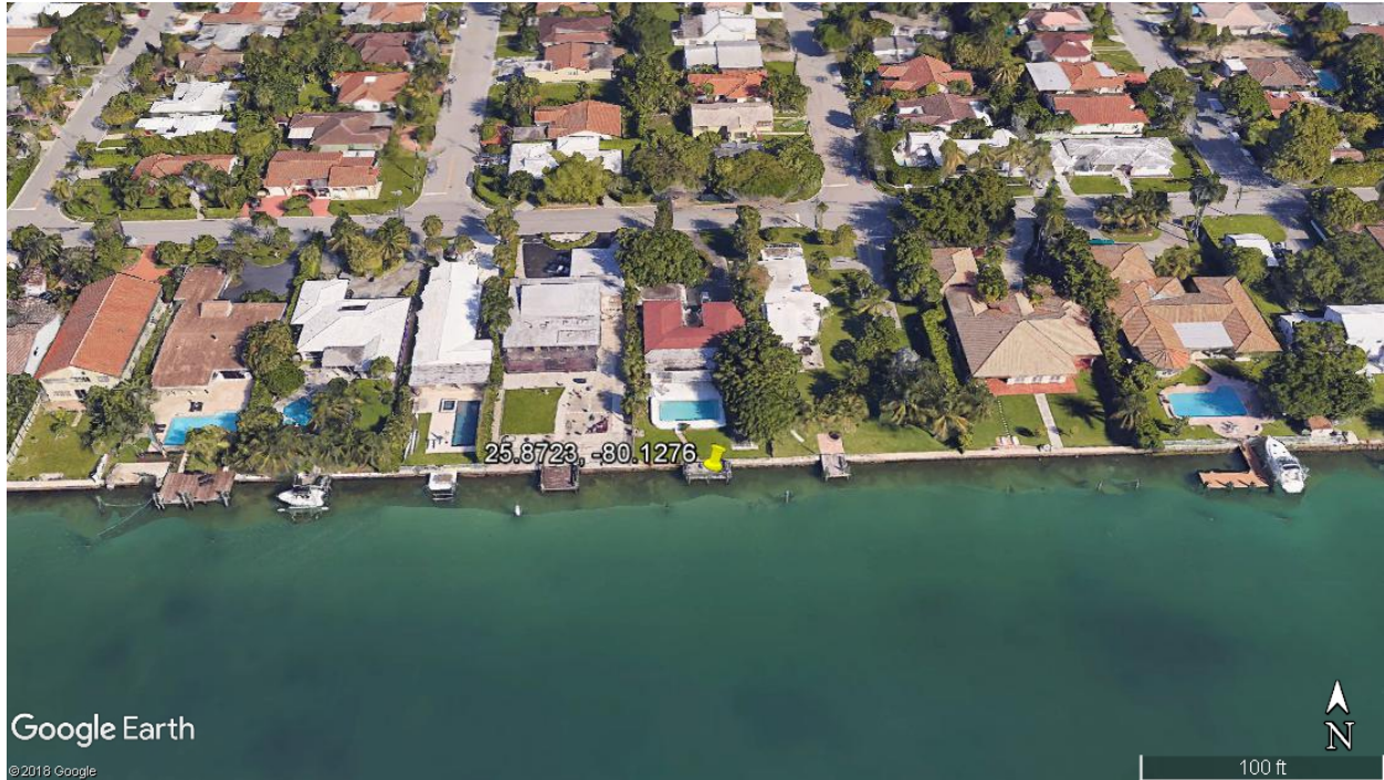
Figure 1. Image of Steckhan property.

All piles will be driven using a barge-mounted impact hammer. In-water work will take approximately 30 days to complete and will be conducted during daylight hours only. Turbidity curtains will be used during construction. Additionally, the applicant will comply with NMFS's Sea Turtle and Smalltooth Sawfish Construction Conditions , 1 which requires work to stop if sea turtles or sawfish are observed within 50 feet (ft) of operating or moving construction equipment.