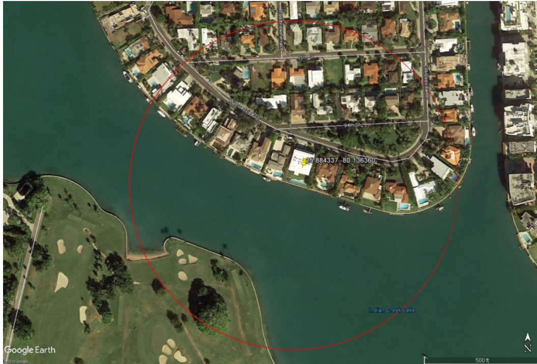
Figure 3. Image showing the action area defined by the extent of behavioral noise effects based on the proposed action’s installation of 12-in concrete piles using impact hammer.