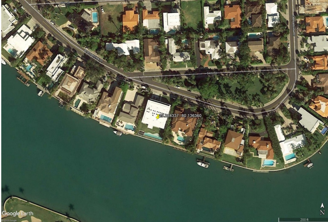
Figure 2. Image showing the project site in Biscayne Bay at 9414 West Broadway Drive, Bay Harbor Islands, Miami-Dade County, Florida, in relation to the immediate surrounding area.

The action area is defined by regulation as “all areas to be affected directly or indirectly by the federal action and not merely the immediate area involved in the action” (50 Code of Federal Regulations [CFR] 402.02). As such, the action area includes the areas in which construction will take place, as well as the immediately surrounding areas that may be affected by direct effects and indirect effects of the proposed action. Based on our noise analysis in SAJ-82, 5 the action area is equivalent to the radius of behavioral noise effects to ESA-listed fishes based on the proposed action’s installation of 12-in concrete piles using impact hammer (i.e., 705-ft behavioral noise radius; Figure 3).