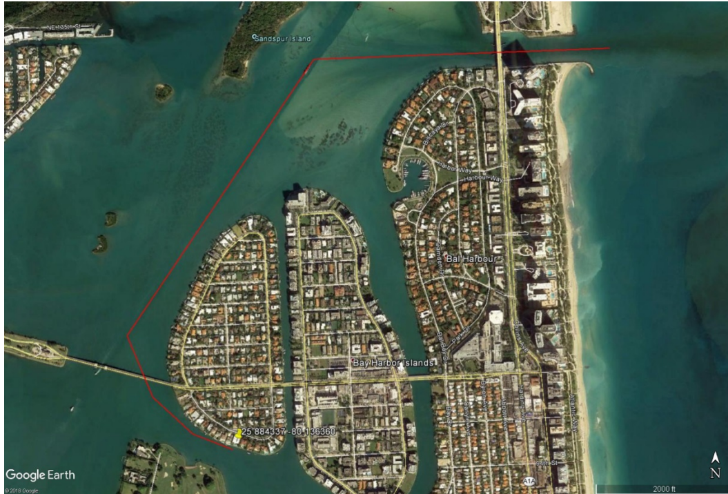
Figure 1. Image showing the project site (yellow pin) in Biscayne Bay at 9414 West Broadway Drive, Bay Harbor Islands, Miami-Dade County, Florida, in relation to the nearest opening to the Atlantic Ocean.

A benthic survey was performed on January 21, 2016. There were no mangroves or corals within the survey area. There were sponges and seagrass species ( Halodule wrightii and H. decipiens ) present within the survey area; however, no existing seagrasses will be shaded due to the proposed action. Johnson's seagrass was not present within the survey area. The project site is a residential property with an existing seawall adjacent to other residential properties with existing seawalls, docks, and boat slips (Figure 2). Depths within the survey area were 2.7 ft mean high water (MHW) at the seawall and approximately 5 ft MHW at 23 ft waterward of the seawall.