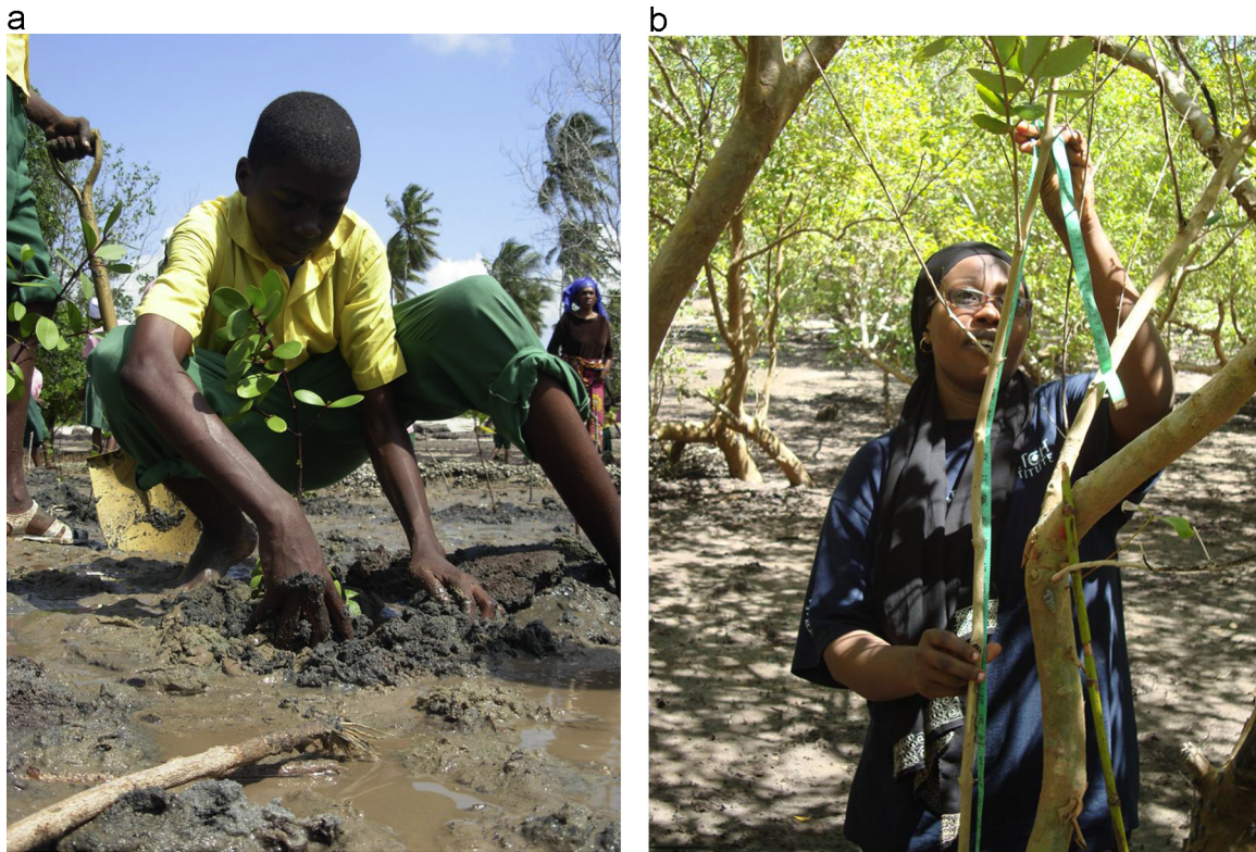
Fig. 1. (a) Mangrove seedling planting in the Mikoko Pamoja project; (b) Woman measures a mangrove sapling on project site.