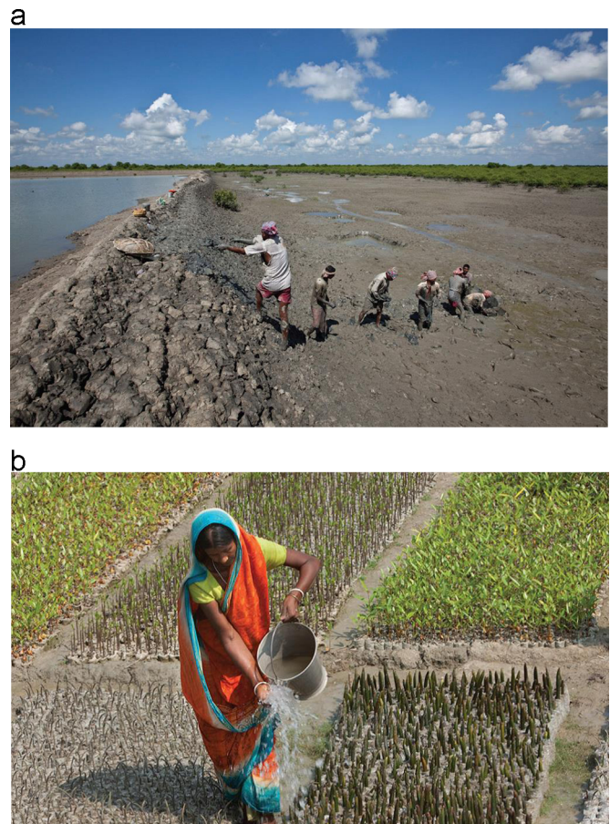
Fig. 3. (a) Embankment construction in the Sundarbans; (b) Local woman waters mangrove seedlings in the Sundarbans.

The Sundarbans, a group of islands extending between West Bengal in India and Southern Bangladesh, are home to the largest estuarine mangrove forest on Earth. More than 28% of its land has been lost in the past 40 years from the effects of sea level rise due to climate change, rapidly degrading its mangrove ecosystem [25]. Anthropogenic factors such as population growth and subsequent ecosystem disturbance, and prawn harvesting have also contributed to the degradation of mangroves in this area [26]. These mangroves provide important ecosystem services for the local communities of approximately five million people, acting as