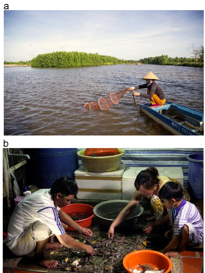
Fig. 2. (a) Vietnamese man harvests shrimp in the Mekong Delta; (b) Farmers participate in the organic shrimp industry as a part of the Markets and Mangroves Project.

Vietnam's seafood and aquaculture markets comprise a six billion dollar industry, of which shrimp farming makes up about a third (Fig. 2a), contributing significantly to the livelihoods of the coastal communities [22]. However, the environmental impact of this industry is severe, and as the shrimp industry has grown, mangrove ecosystems have been lost at an alarming rate-over half