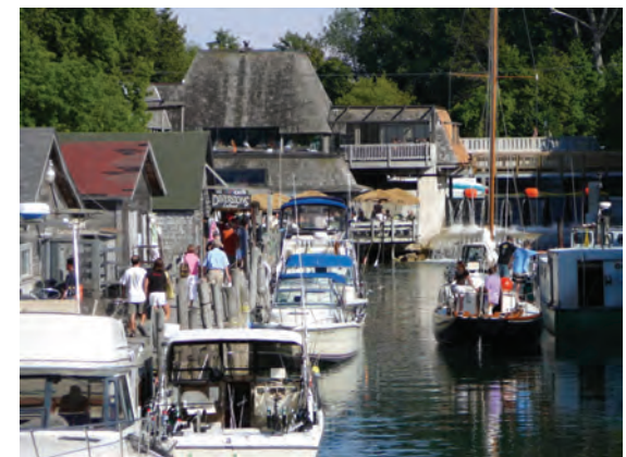
Michigan Sea Grant