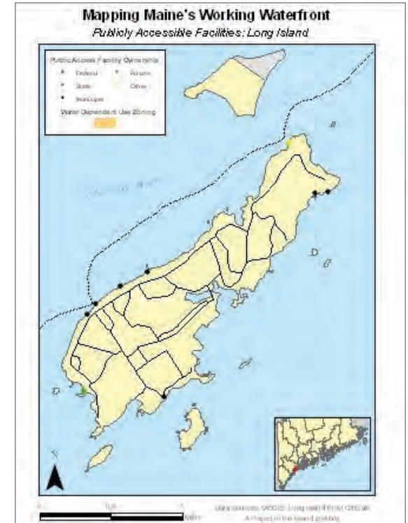
Island Harbor Institute