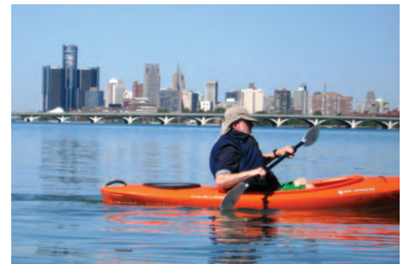
Detroit Yacht Club