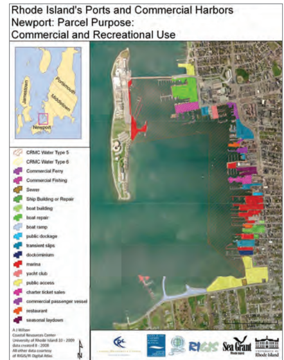
Rhode Island Sea Grant