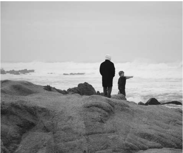
Father and son gaze out over large swells at Point Pinos on the Monterey Peninsula.