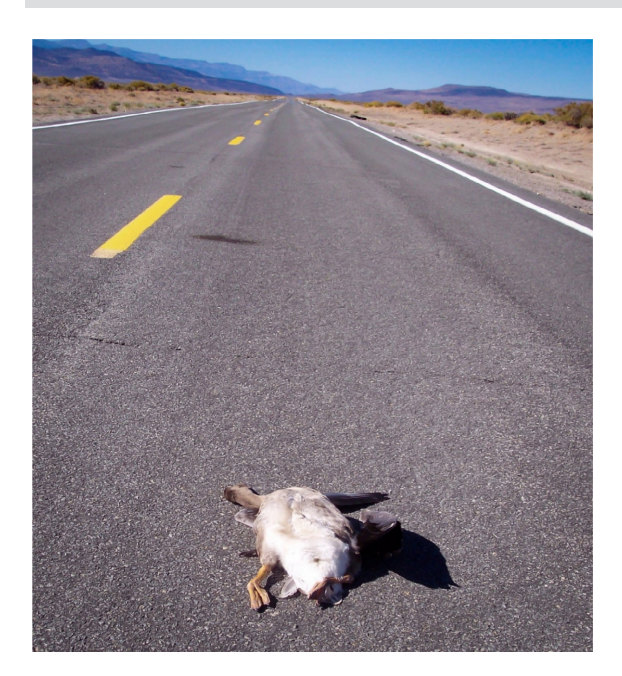
FIG. 1. Goose mortality during migration. Juvenile greater white-fronted goose ( Anser albifrons ) without external injury and weighing nearly half (~1 kg) of a healthy bird's expected weight (~1.8–2 kg) was found dead in the arid desert of northern Nevada following recent wildfires. Cause of mortality is presumed to be starvation occurring during migration.

to similar large-scale disruptions, particularly in the context of route finding and energy expenditure to traditionally used stopover regions.