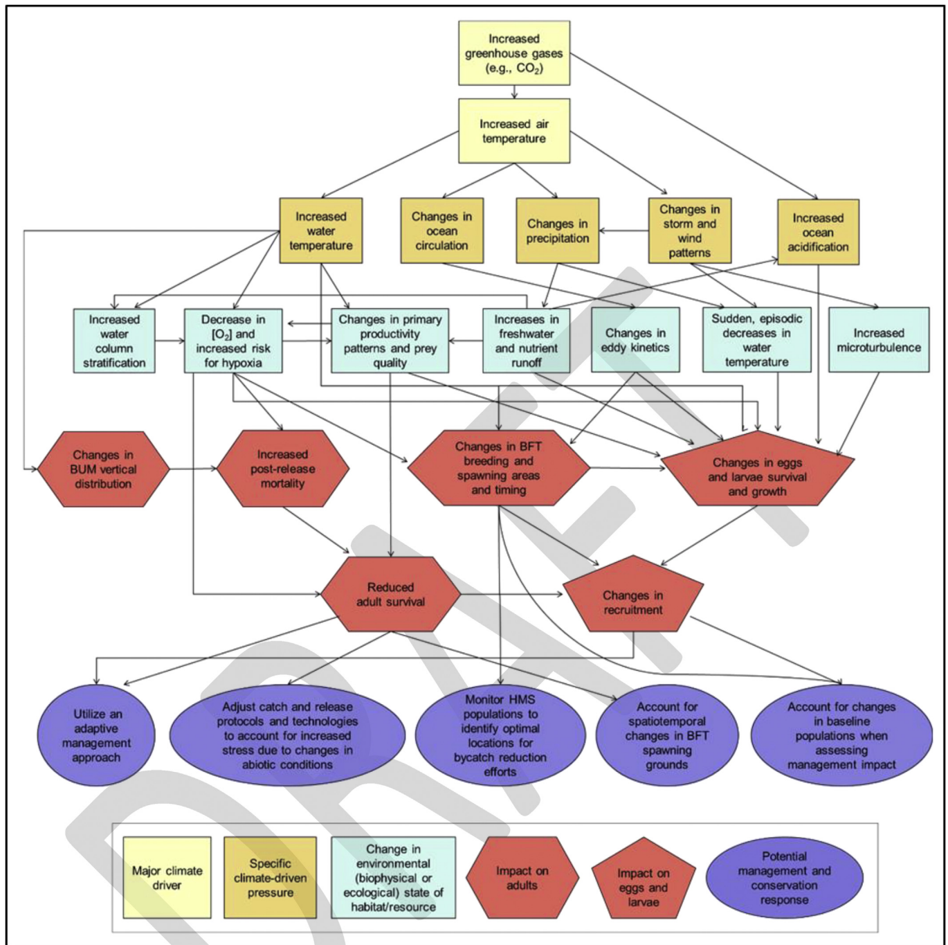
Fig. 2. Summary of potential climate-dependent drivers, pressures, environmental state changes, impacts to adult and eggs and larvae of tuna and billfish in the Gulf of Mexico by 2050, and implications (i.e., responses) for management and conservation. (CO 2 = Carbon dioxide, [O 2 ] = Dissolved oxygen concentration, BUM = Blue marlin, BFT = Atlantic bluefin tuna, HMS = Highly migratory species). This diagram and its framework and terminology are based on the driver-pressure-state-impact-response (DPSIR) approach (see Oesterwind et al., 2016) modified for our analysis purpose. Note that the linkages between climate-dependent drivers, pressures, environmental state changes, and impacts depicted in this figure are those that are most relevant to tuna and billfish in the Gulf of Mexico by 2050, as indicated by our literature review and analysis. Additional linkages and causal relationships may exist that are not depicted here. (For interpretation of the references to colour in this figure legend, the reader is referred to the Web version of this article.)