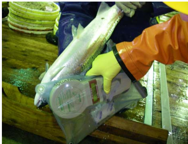
Figure 3. The detector is used to scan both sides of the steelhead's body.