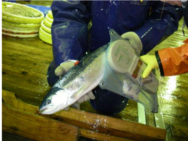
Figure 2. Screening a high-seas tagged steelhead for the presence of a PIT tag using a hand-held detector on the deck of the R/V Wakatake maru , June-July, 2008. The detector is held directly against the fish's skin and waved over the body from head to tail.