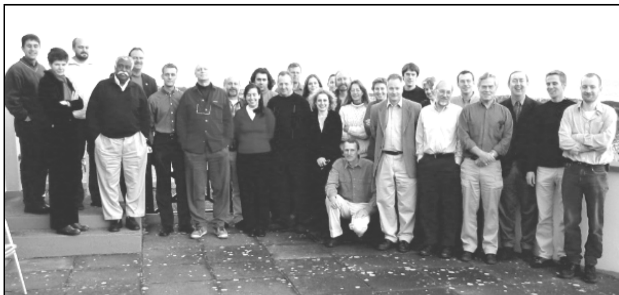
Deep-Sea Corals Workshop Participants