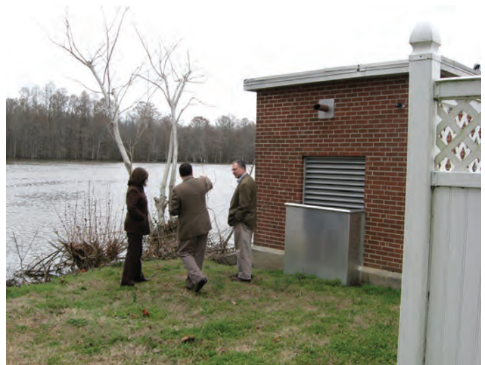
Pumping station adjacent to Roanoke River

evacuate senior housing and/or lose emergency access to certain parts of the town. Flooding of swamps can flush out snakes and bears, which are nuisances to residents. When flooding lasts long enough to result in standing water, mosquitoes become a problem, leading to a public health threat from potential disease transmission. Whether the mosquito problem reaches this point of being a health hazard depends upon the town’s available funding, equipment, and staff for spraying. Town officials can spray for mosquitoes and educate the public about minimizing standing water on their properties. Property owners also can help by