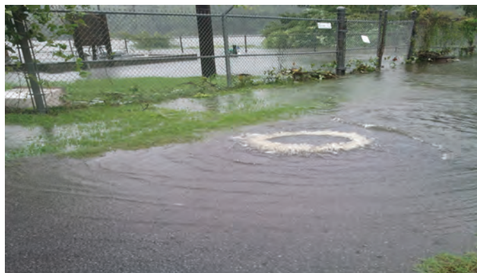
Roanoke Avenue Wastewater Pump Station - Hurricane Irene, August 2011

Those who spoke of flooding in the community mentioned intense rainfall, rising river levels, hurricanes, and wind tides as contributors. They frequently mentioned that road construction and an aging network of drainage ditches also contribute to local flooding. One respondent mentioned that as sea level rises, large drainage ditches could serve as