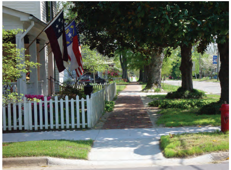
Windley-Ausbon House in Downtown Plymouth

geographic distribution. They all worked or lived in the Town of Plymouth or in Washington County. More specifically, 11 of the interviewees were residents of the town, six lived in Washington County and two lived in other counties. The leaders served various roles in the community including: town and county staff, local (town and county) governing boards, civic, religious, nonprofit organizations, and town business leaders. A majority of the town residents had been there for more than 40 years. Interview questions