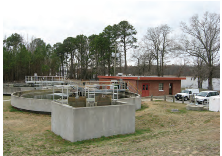
Portion of Plymouth's Wastewater Treatment Plant subject to flooding from the Roanoke River

The town also could create a comprehensive improvement/master plan for repairs, with the assistance of engineering firms to support the planning process and ensure that the plans allow for future development. One plan element might be to inspect infrastructure and commercial establishments more frequently. The participants noted, however, that it would be more effective to also replace water lines at the same time as sewer lines because water mains are located above sewer lines, meaning that repair crews must go around the water lines to conduct the sewer repairs. Water lines are frequently as old as the sewer lines, and can break during the sewer line repair process. Therefore, this type of adaptation also would depend upon the availability of grants to repair both sewer and water lines.