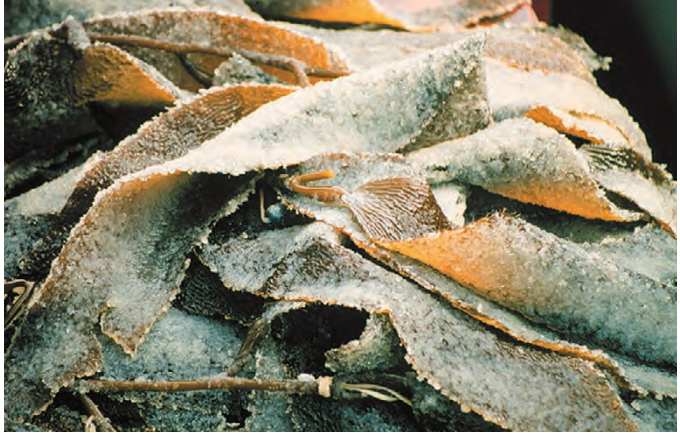
Herring eggs on kelp