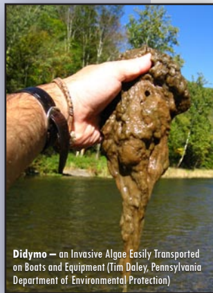
Didymo – an Invasive Algae Easily Transported on Boats and Equipment

The biosecurity protocols being developed will ensure that, to the extent practical, all equipment being moved will be properly washed and disinfected to prevent the introduction and spread of aquatic invaders. The protocols will be shared with other state agencies and members of the general public that are at risk of accidentally transporting aquatic invasive species.