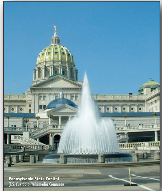
Pennsylvania State Capitol

There is no adequate source of funding for long term management activities to mitigate the impact of established populations and there is often little money left for the restoration of damaged ecosystems. Education and outreach also require funding for implementation of successful social marketing campaigns and the development and distribution of materials.