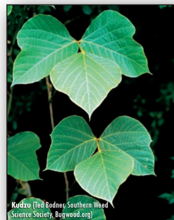
Kudzu

Kudzu is a perennial, semi-woody climbing leguminous vine originally introduced into the United States as an ornamental plant at the Philadelphia Centennial Exposition of 1876. It was heavily planted in the 1950s throughout the U.S. to prevent erosion, particularly in the south, until its tendency to completely replace existing vegetation was noted. Kudzu was added to the state noxious weed list in 1989 and a pilot eradication program was launched in 2006. As of 2008, more than 89 spatially distinct populations of kudzu have been confirmed at sites throughout Pennsylvania.