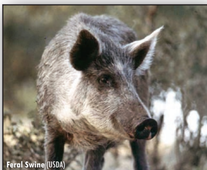
Feral Swine

Feral swine cause considerable damage following accidental or intentional introductions. Since 2007, the United States Department of Agriculture has gathered evidence that feral swine are establishing small breeding popula-