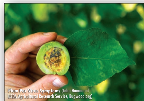
Plum Pox Virus Symptoms

Plum pox virus is one of the most destructive viral diseases of stone fruit crops worldwide. The federally regulated plant pathogen was detected for the first time in North America in Adams County, PA in September 1999. Tree yields can be severely affected - some reports claim 80-100 percent reductions in yield. Infected fruit may be unsightly and difficult to sell. If the virus is discovered in a state, export of fruit is difficult and export of budwood and nursery stock is next to impossible. Pennsylvania has had two consecutive years of negative plum pox survey results. After a third year, the commonwealth can declare plum pox has been successfully eradicated.