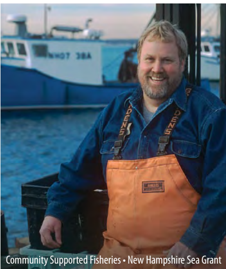
Community Supported Fisheries • New Hampshire Sea Grant

In addition to the informal linkages, SGE has regional networks along six geographic boundaries—Great Lakes, Pacific, Gulf of Mexico, Southeast, Mid-Atlantic and Northeast. These independent groups were first designed in the 1970s to respond to issues of regional concern, conduct educational programs, and offer training for SGE personnel. The chairpersons of these regional networks serve as ex officio members of the SGA Assembly's Executive Committee.