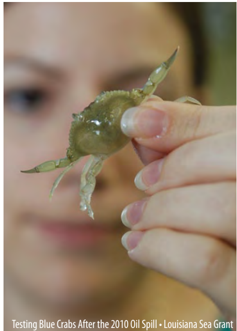
Testing Blue Crabs After the 2010 Oil Spill • Louisiana Sea Grant

Collectively, these mechanisms can be referred to as outreach. Outreach can be defined as those activities that extend Sea Grant and other relevant coastal, ocean and Great Lakes information to people. Any activity that extends new understanding fits this definition and may come in many forms. Hosting a webinar or responding with research-based information to an email inquiry are both outreach activities. Working with a shellfish grower to develop better spawning techniques; summarizing Sea Grant research results in a fact sheet; teaching educators who will, in turn, teach their students; training seafood processors in the safe handling of seafood; and helping a coastal municipality review its planning and zoning regulations to address local water quality concerns are all techniques to extend university knowledge.