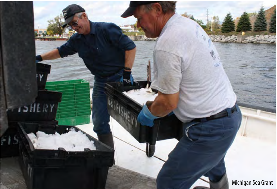
Michigan Sea Grant

In addition to informal networking on a topical basis, SGE programs often call on the expertise of peers from other states to help address specific issues. Extension professionals have remarkable backgrounds and are experienced in fields ranging from aquaculture, beaches