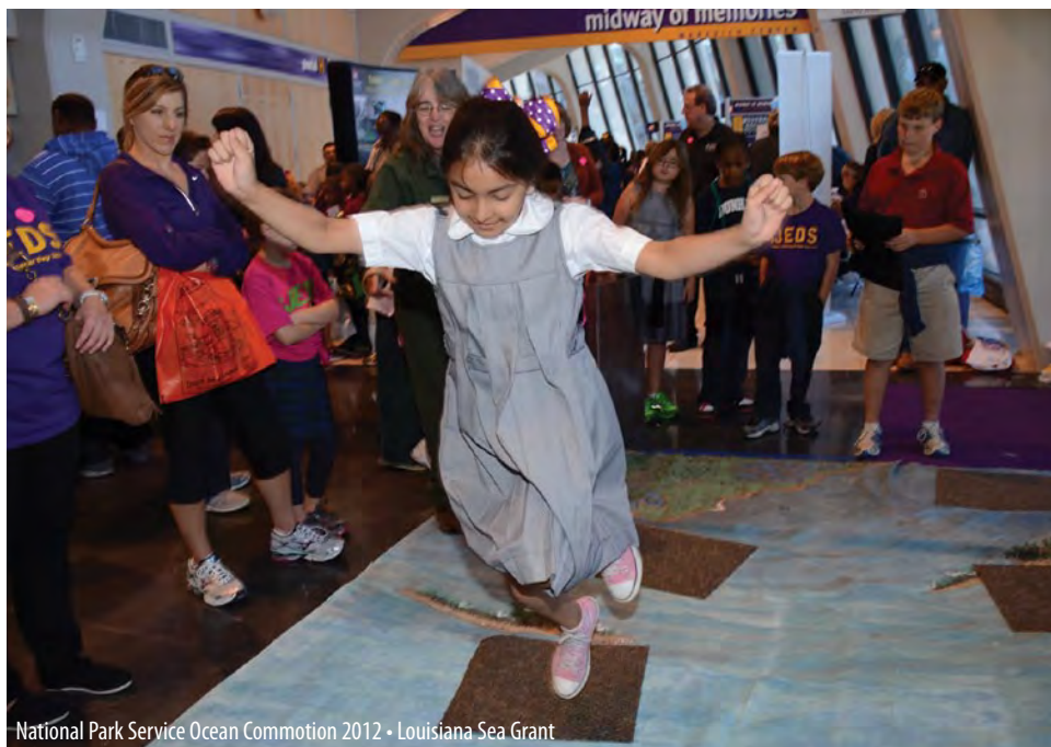
National Park Service Ocean Commotion 2012 - Louisiana Sea Grant

There are no indications that the coastal growth trend is abating. On the contrary, census data indicate that between 1970 and 2010, the country’s coastal population increased