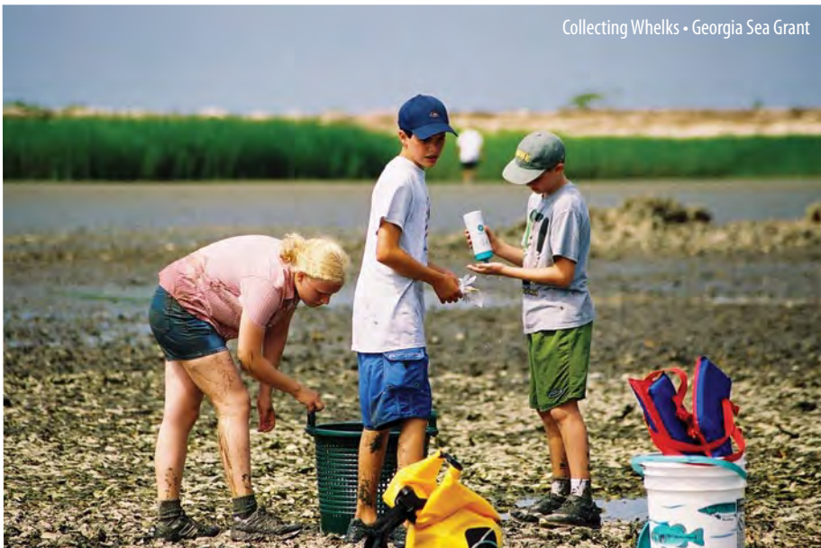
Collecting Whelks • Georgia Sea Grant

Sea Grant Extension Assembly (Assembly) – The Assembly is an association of extension program leaders representing each Sea Grant program and its extension staff. It is governed by a set of by-laws and led by elected officers: Assembly Chair, Chair-Elect, Secretary-Treasurer, and two At-Large Delegates.