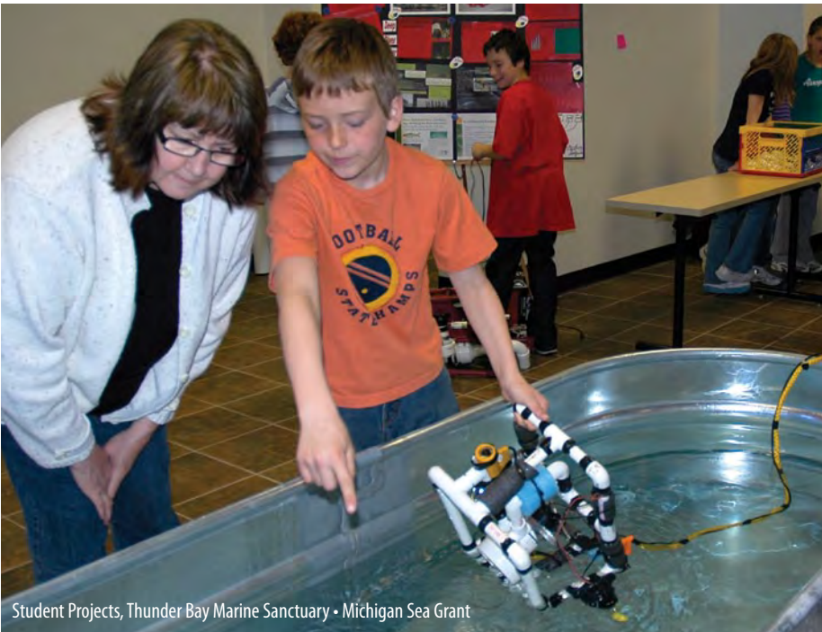
Student Projects, Thunder Bay Marine Sanctuary • Michigan Sea Grant

In most cases, a Sea Grant program is hosted by one university or university system within