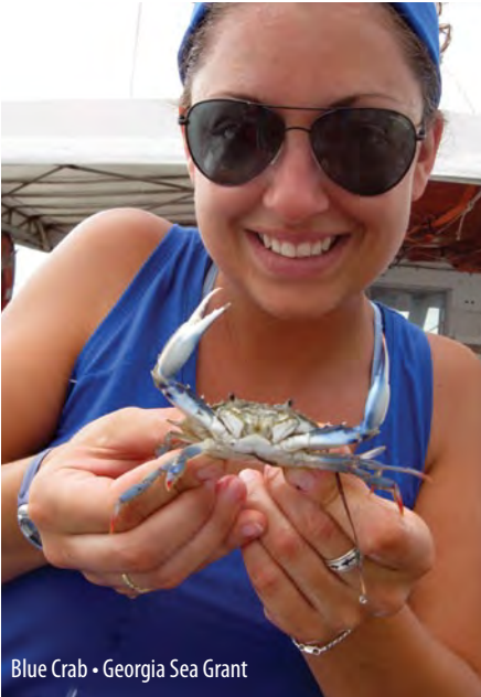
Blue Crab •

There are six extension regions (Northeast, Mid-Atlantic, South Atlantic, Gulf, Pacific, Great Lakes) each with a regional representative who acts as a liaison with the Assembly's elected officers who compose its executive committee.