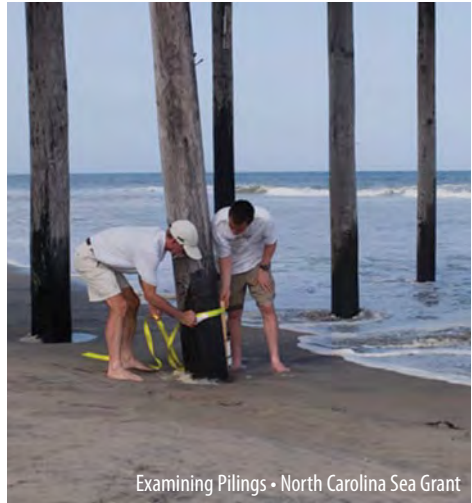
Examining Pilings • North Carolina Sea Grant