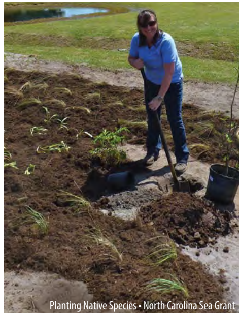
Planting Native Species • North Carolina Sea Grant