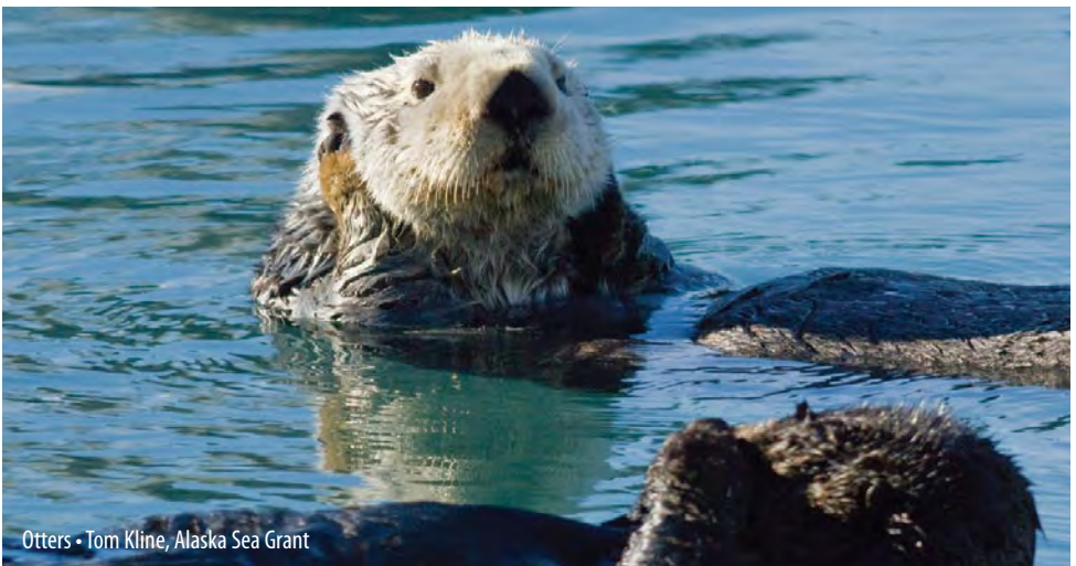
Otters