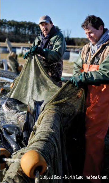
Striped Bass • North Carolina Sea Grant