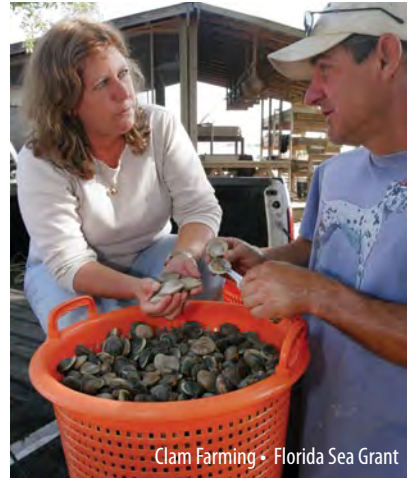
Clam Farming • Florida Sea Grant