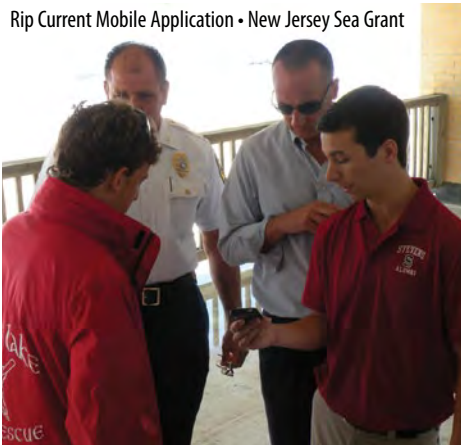
Rip Current Mobile Application • New Jersey Sea Grant