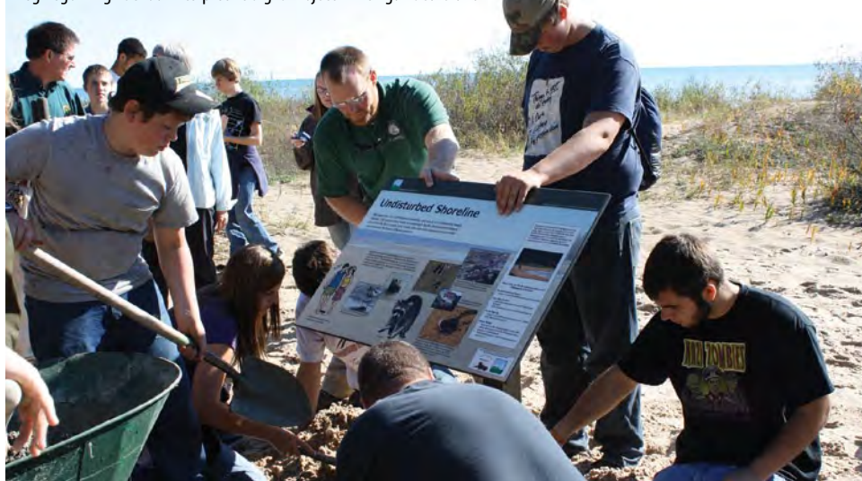
Negwegon High School Interpretive Signs Project • Michigan Sea Grant

One challenge for all extension professionals is to identify the stakeholders with whom they will work, as well as the projects on which they will work. You may have your general topic area, but where and with whom do you start addressing which issue? The possibilities are endless and you will likely be approached by stakeholders with more ideas and suggestions than you could ever meet. The most important thing to remember when getting input from stakeholders and advisory groups is to distinguish between their wants and needs, and between perceived and actual solutions that will achieve the desired outcome. At times, stakeholders express a specific solution as needed, but there are often multiple solutions, and the stakeholder may be seeing the issue from only one perspective. There are both formal and informal mechanisms to help you determine needs and how you to address them.