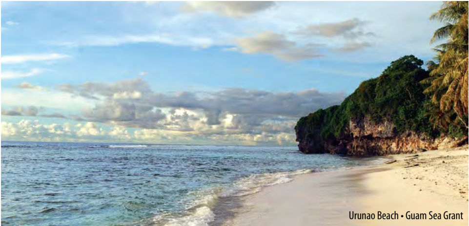
Urnao Beach • Guam Sea Grant

among academia, state, federal, and industrial institutions in fisheries. . . . do what wise men have done for the better cultivation of the land a century ago. Why not have ‘Sea Grant Colleges?’” He was referring to the radical idea of bringing teaching, research and extension into contemporary society that began with the Morrill Land-Grant Acts of 1862 and 1890.