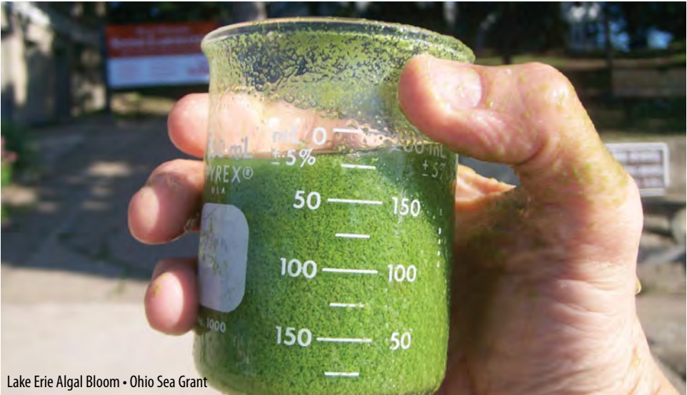
Lake Erie Algal Bloom • Ohio Sea Grant

The simple premise for the geographic networks is that nearby states confront similar challenges, and SGE staff members work in relatively close proximity to each other, thus allowing for more interaction and pooling of resources. There is variability in the level of activity within each of the Sea Grant regions. Most regions meet face-to-face every year or two and carry out training for agents and specialists, discuss projects and current regional issues, and plan joint activities. Other regions have minimal formal activities and plan and carry them out on an informal basis. Program leaders and specialists attending the network's two-biennial meetings — Sea Grant Week and the Sea Grant Extension Assembly — also meet to discuss regional topics.