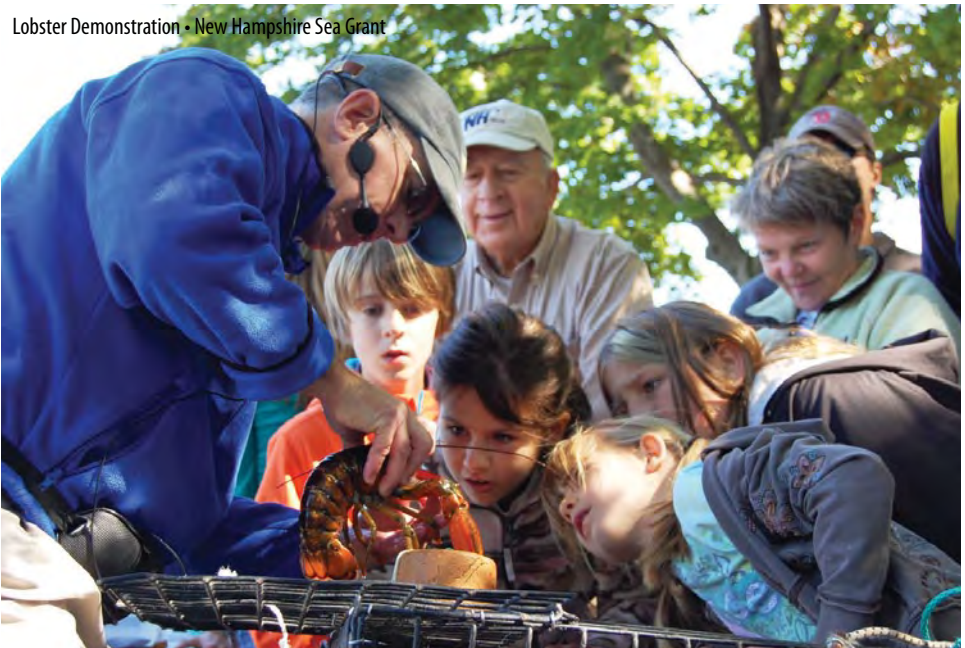
Lobster Demonstration • New Hampshire Sea Grant

Nevertheless, it is not our role to decide which of the science or policy alternatives should ultimately be implemented on a federal, state, or local level. In our own minds we may be quite certain that a particular policy alternative is in the best public interest; however, there are other voices that have a right to be heard, even if they lack our scientific sophistication. All of which brings us to the question of why neutrality is so important.