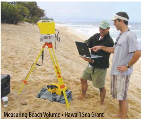
Measuring Beach Volume • Hawai'i Sea Grant

Sea Grant is based on the Land Grant model of the Cooperative Extension System (CES). Approximately two-thirds of SGE programs are formally affiliated with state Cooperative Extension programs. Whether your program has this formal affiliation, it makes sense for SGE professionals to collaborate with Cooperative Extension. Many topics are similar, such as water quality/quantity, climate change, land use and run-off, and hazard preparation for storms or flooding. Many formats are similar, such as workshops, community programs or webinars.