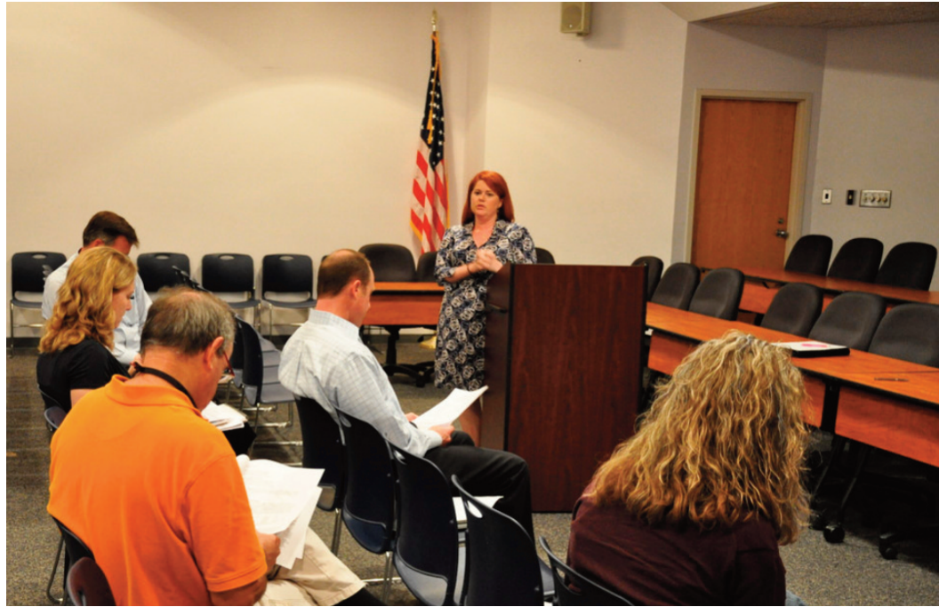
PPI Committee Meeting, March 14, 2016.