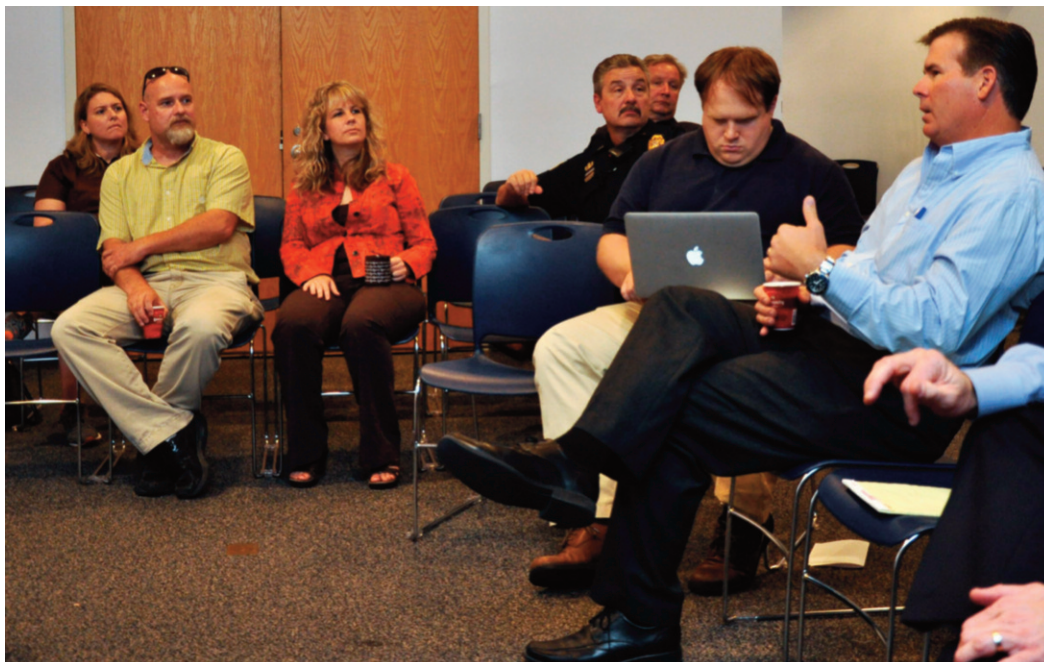
PPI Committee Meeting, October 22, 2015.

The PPI Committee has convened twice to work on the PPI formally, in addition to informal reviews of the PPI through the development phase. The two formal meetings were held on October 22, 2015 and March 14, 2016. The first meeting explained the PPI process and the role of the committee. The second meeting focused on current and future outreach projects and a review of the draft document. In addition, the PPI Committee has reviewed draft PPI documents on an on-going basis.