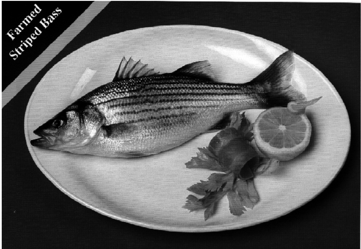
Figure 1. Point-of-purchase promotion, like the recipe card shown below, often enhances sales.