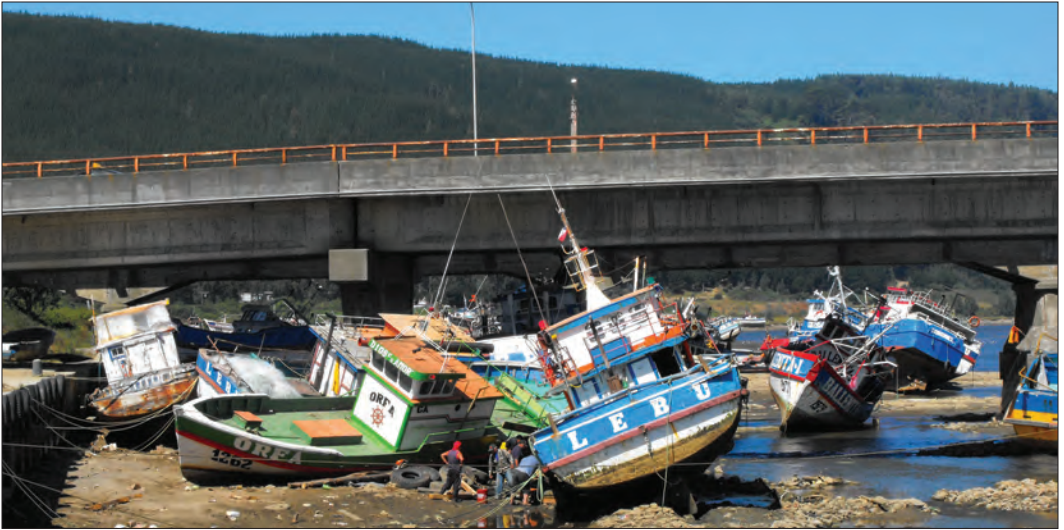
Lebu, Chile. A major 8.8 magnitude earthquake off the coast of Chile on February 27, 2010 caused massive destruction of buildings as well as a devastating tsunami which destroyed several coastal towns and commercial fishing vessels.