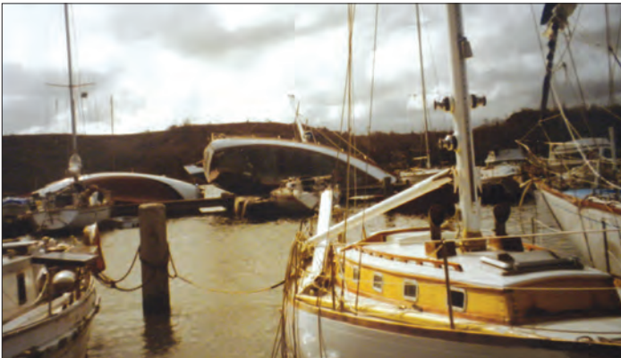
This was a common sight in the small boat harbors in Kaua'i after Hurricane Iniki struck in 1992. Picture taken at Nāwiliwili Small Boat Harbor.