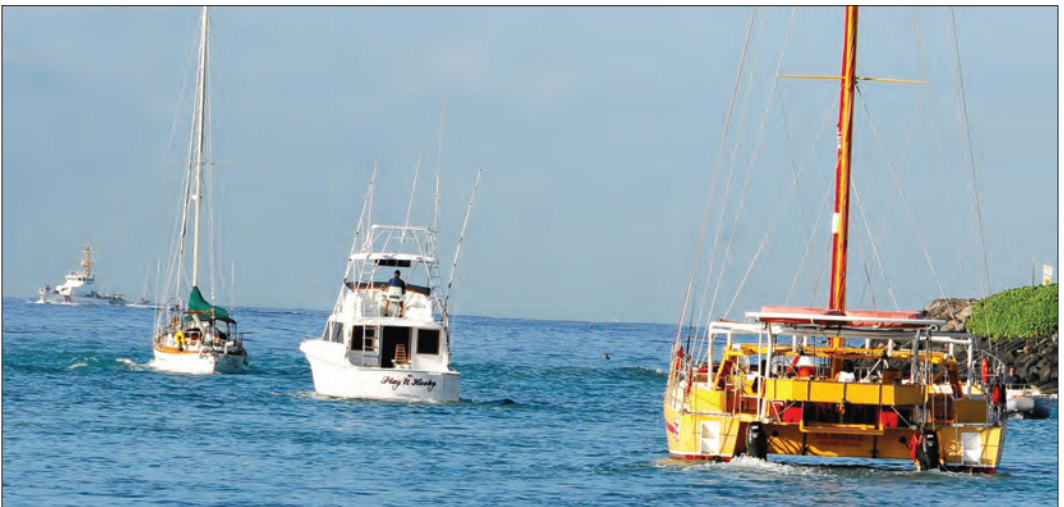
O'ahu, Hawai'i. In response to the large earthquake and tsunami in Chile on February 27, 2010, a tsunami watch and later warning was issued in Hawai'i. Here boats at Kewalo Basin on O'ahu head to deeper water. The Coast Guard vessel in the background is observing operations and ready to provide assistance. During a tsunami warning, boats going to sea should stay at depths greater than 300 feet and at least 2 miles from the channel entrance.