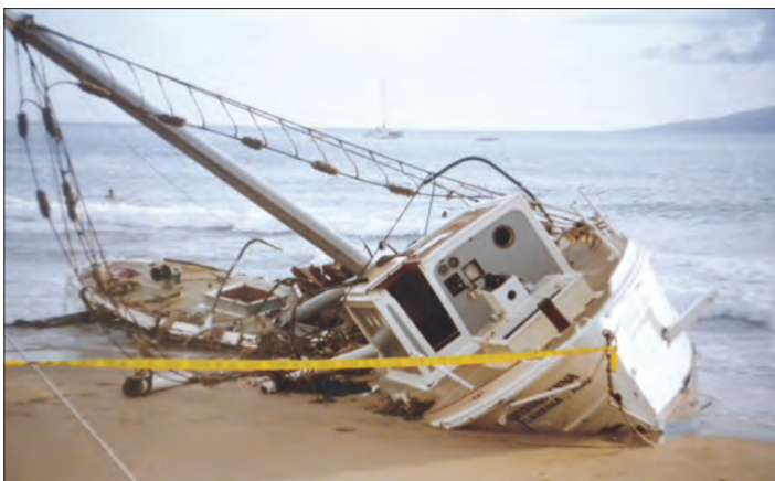
This boat was destroyed and beached in front of the Sheraton at Black Rock at Ka'anapali Beach, Maui, by Hurricane Iniki in 1992.