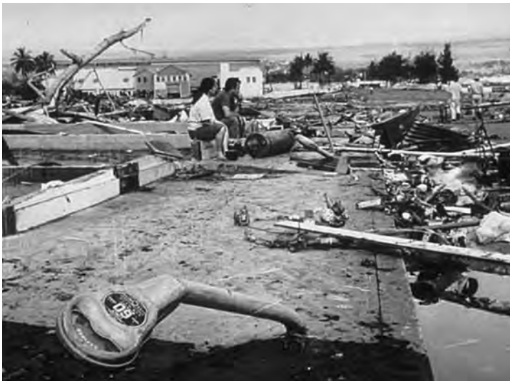
Hilo, Hawai'i. The tsunami that struck Hilo on May 23, 1960 was caused by a magnitude 9.5 earthquake off of Chile the day before. Water and debris carried enough force to crush wooden buildings and twist parking meters by the time it hit Hilo 15 hours later.