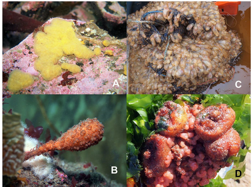
Figure 2. Some of the species identified at the Magellanic zone (left), and at the temperate zone (right). A, Distaplia colligans ; B, Polyzoa opuntia (stalked form); C, Ciona robusta (formerly C. intestinalis sp A) (on scallop culture gear); D, Asterocarpa humilis (on top of Pyura chilensis ).