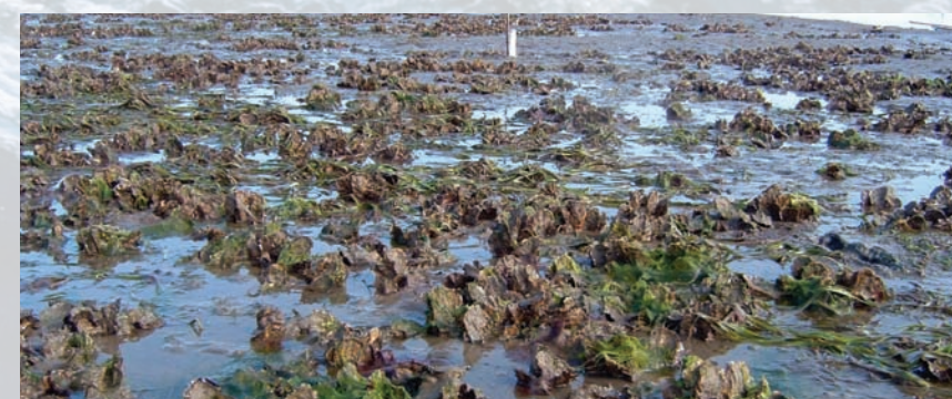
Canary in the coal mine? Pacific oysters in Willapa Bay, Washington, have experienced six years of recruitment failure. Similar periods of low recruitment have been recorded in the past but the cause is unknown.