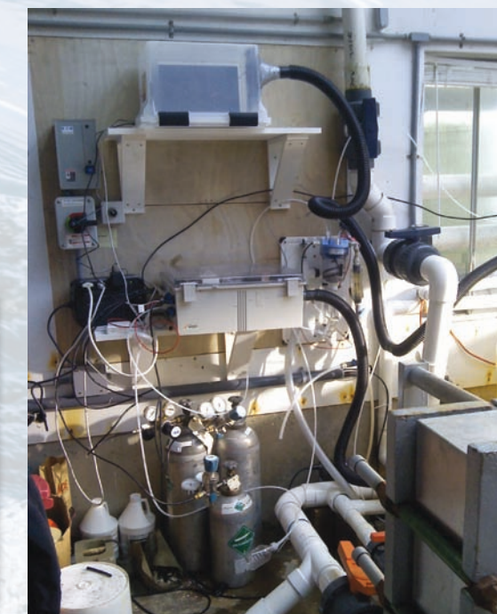
Whiskey Creek and other hatcheries have installed continuous water monitoring and treatment systems.

Mounting evidence suggests that ocean acidification may change the structure, function and biodiversity of marine ecosystems. In 2009, Congress passed the Federal Ocean Acidification Research and Monitoring (FOARAM) Act, authorizing federal ocean acidification research funding through NOAA, NASA and the National Science Foundation. The Act also established an interagency committee to develop a national ocean acidification strategic research and monitoring plan, expected to be completed in spring 2011. The national strategic plan process is now seeking recommendations, and this workshop is an important step toward developing a regional plan for the West Coast.