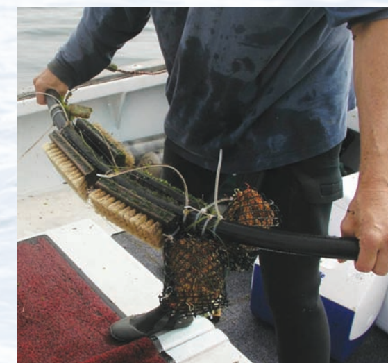
Common scrub brushes have proved to be efficient and cost-effective collectors to study larval settlement in marine field studies.