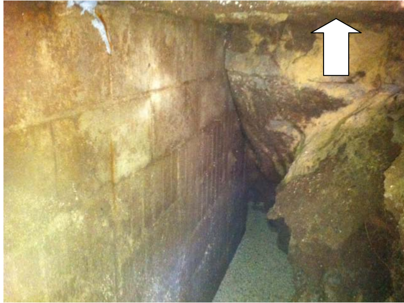
Figure 3. Behind seawall, showing cavity undermining base of the concrete slab lanai (arrow) above.