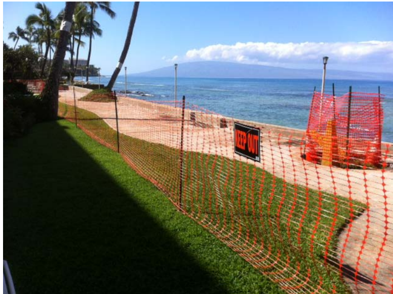
Figure 1. The shadow of the Makani Sands AOA Condominium, Honokawai, West Maui, Hawaii, overlooks the seawall and attached concrete lanai that has been undermined by wave action, awaiting potential collapse and triggering a Maui County Special Management Area Emergency Permit.