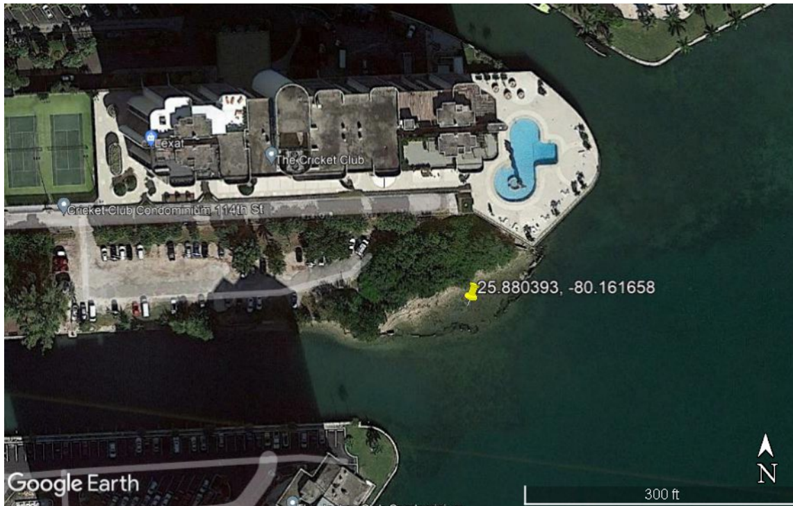
Figure 1. Image showing the remnant seawall proposed for replacement at the project site in Biscayne Bay at 11295 Biscayne Boulevard, Miami, Miami-Dade County, Florida

The project site is a commercial-zoned property on Biscayne Bay with a parking lot, some vegetation, an existing, intact seawall, and remnants of an existing seawall at the eastern end of the property. A benthic assessment was performed by Miami-Dade County on February 5, 2021. The USACE described the substrate within the proposed project footprint as consisting of small rock rubble and debris. Water depths at the project site range between 0.4 and 3.2 ft at mean low water (MLW). The project site has one red mangrove, two white mangroves, and three silver buttonwoods present. There are no Johnson’s seagrass or ESA-listed corals in the project area.