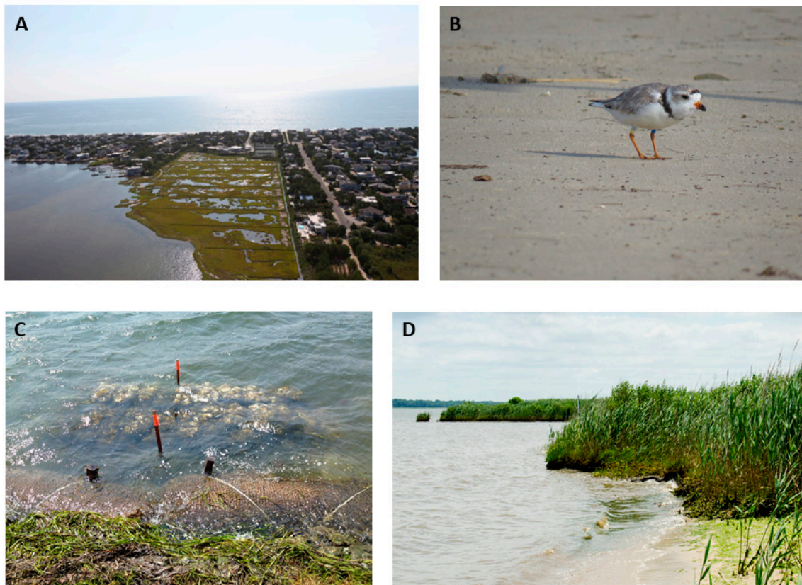
Figure 3. Salt marsh systems, shown here at E.B. Forsythe NWR in New Jersey (A), provide important coastal habitat for wildlife such as Piping Plovers (B) and also offer storm protection for seaside human communities. Many NWRs along the eastern coast of the United States utilize NbS to make areas more resilient to climate change, such as this oyster reef constructed at J.H. Chafee NWR in Rhode Island (C) and living shoreline at Eastern Neck NWR in Maryland (D). NbS can also address climate uncertainty since they expand over time and are capable of responding to unanticipated changes.

opportunities and needs to evaluate the ecological, economic, engineering, and social costs and benefits of NbS strategies.