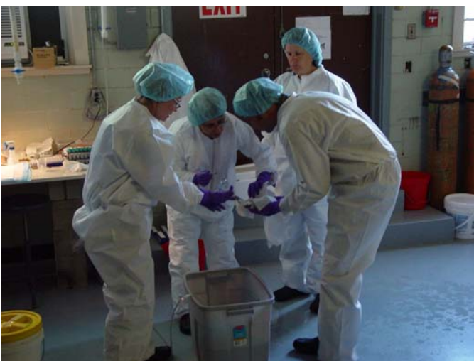
Researchers conduct Atlantic salmon disease resistance trials at the University of Maine Cooperative Extension, Maine Aquatic Animal Health Laboratory.