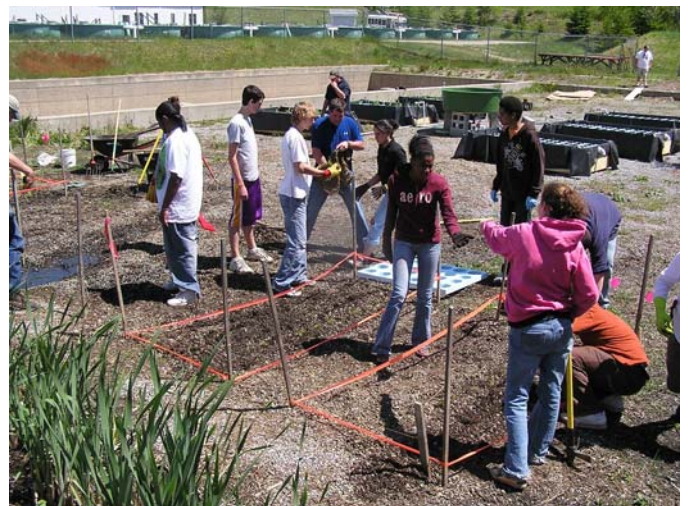
Students from Lubec Consolidated High School and Washington Academy assist in an NRAC-funded research project to develop the culture of native wetland restoration species as a new aquaculture industry.