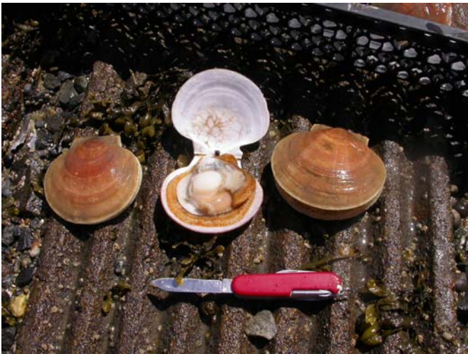
Sea scallops ( Placopecten magellanicus ) raised at the Darling Marine Center in Walpole, Maine, for education and demonstration. Shucked individual is female; note the orange roe sac. Scallops are not fully developed as an aquaculture species in Maine, although the wild fishery uses aquaculture techniques such as spat collection for wild stock enhancement.

issues and solutions, collaborating with regional partners on the biannual Northeast Aquaculture Conference and Exposition (NACE), convening forums where industry and concerned citizens can work on issues of concern, organizing visits to aquaculture sites and facilities, and various speaking engagements. ME SG also produces publications relevant to the aquaculture industry.