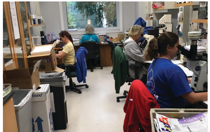
Figure 6. After water samples are collected and shipped to FWRI, biologists use microscopes to scan each sample for the presence of harmful algae such as red tide.

FWRI relies on local governments, organizations, and volunteers to collect water samples on a weekly, bi-monthly, or monthly basis. These water samples are evaluated for the presence of algae that cause harmful algal blooms (Figure 6), such as Karenia brevis . These data are used to inform communities throughout the state of Florida about the presence and intensity of red tide blooms. To sign up, visit: http://myfwc.com/research/redtide/monitoring/current/offshore-monitoring/