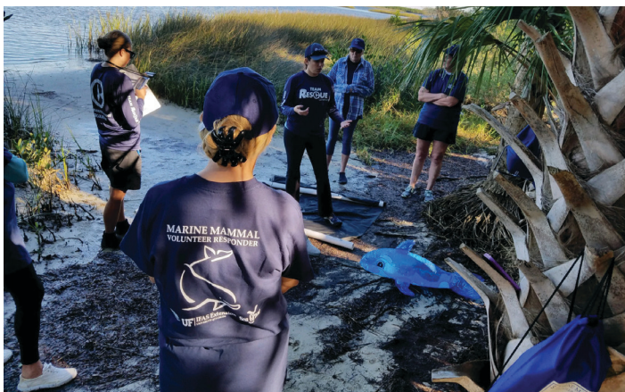
Figure 3. Local volunteers in Hernando County work with Clearwater Marine Aquarium biologists on marine mammal stranding response and rescue skills. Once certified, volunteers are called to assist and are often the first responders on site.

Volunteer teams record the animal's vitals and other important data while waiting for the rescue team to arrive (Figure 3). This includes recording the manatee's rate of breathing and making other behavioral observations, taking samples of bodily discharge, and taking pictures. In order to help manatees stay afloat while they are paralyzed or having seizures, teams sometimes use floatation aids like pool noodles. (Please note that tampering with a manatee in the wild is a second-degree misdemeanor and only those who have been properly trained can assist with these rescues.)