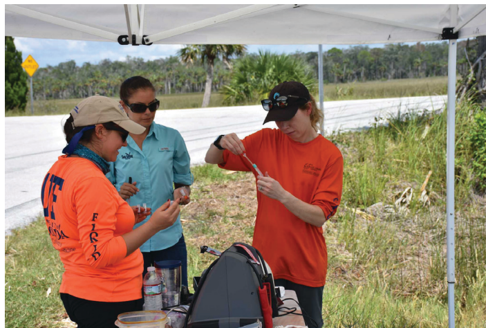
Figure 4. Blood samples are taken from sick and distressed manatees at rescue sites by biologists and veterinarians to determine the next steps of rehabilitation and release.

The team then contacts the nearest critical care facility to see if they have space and resources to stabilize and treat the animal. There are four of these facilities in the United States, all in Florida. Veterinarians and aquarium staff at the Jacksonville Zoo and Gardens, SeaWorld Orlando, Miami Seaquarium, and the Lowry Park Zoo assess the incoming patients and create a treatment plan to prepare them for their release back into the wild.