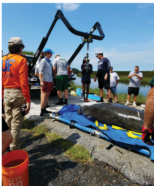
Figure 5. Rescue teams have specialized equipment that they can bring to stranding sites to better assess the health of a sick or injured animal. In this photo, FWC biologists and UF veterinary staff work together to obtain the weight of this manatee, Shamrock.