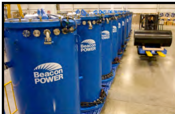
Figure 3: The Smart Energy flywheel constructed by Beacon Power [Photo: Beacon Power].

Much like wind turbines, the concept of a flywheel has been around for centuries. However, in the last decade there have been rapid advancements in the technology associated with the flywheel energy storage. The current flywheel technology has a rotor made out of carbon filaments and can turn at speeds up to 50,000 rotations per minute (rpm) (Figure 3). The average flywheel used for grid energy storage only spins at a top speed of around 16,000 rpm. To reduce friction, the rotor is contained within a vacuum container and suspended between two electromagnetic bearings [26]. Flywheels work by accelerating the rotor inside the vacuum to an extremely high speed (approximately 1,500 miles per hour) and maintaining the energy invested into the system as rotational energy. Slowing down the flywheel releases the energy stored in the device and powers a generator [27].