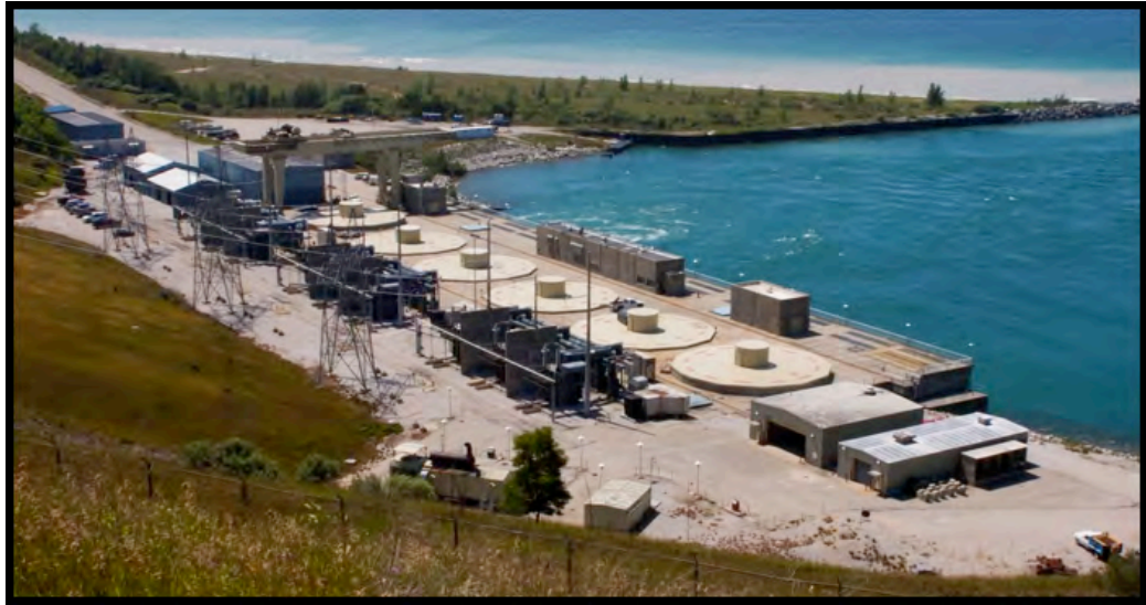
Figure 2: Ludington Pumped Storage Plant's six turbines.

The Ludington Pumped Storage Plant could be used to store excess energy produced by wind farms.